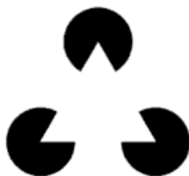
Fig. n. 1 Kanizsa triangle: the ‘sides’ seen extending between the discs are illusory, as the difference in lightness of the triangle and the white background.

Illusory contours are those perceived without any luminance or colour change between two areas. A classic example of illusory contours is the “Kanizsa triangle” (Kanizsa, 1976).