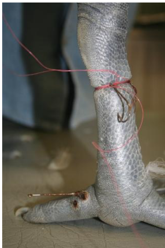
Figure 1. An Australian pelican with a fishing hook injury to the leg, with the attached line forming a ligature. Failure to remove the line may have resulted in deep infection and/or amputation.