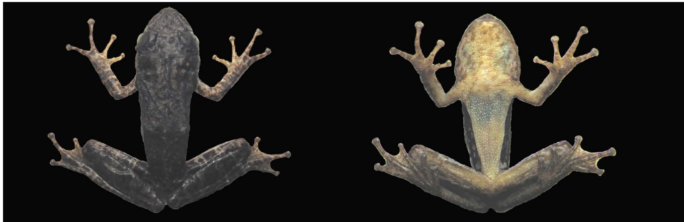
FIGURE 2. Dorsal (A) and ventral (B) view of an adult female Scinax centralis (MZUFV 6511, 26.55 mm snout-vent length) from Campo Alegre de Goiás, state of Goiás, Brazil.