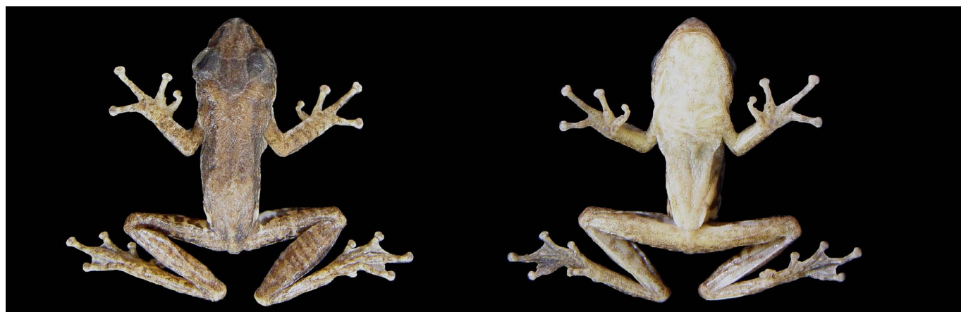
FIGURE 1. Dorsal (A) and ventral (B) view of an adult male Scinax centralis (MZUFV 6509, 22.05 mm snout-vent length) from Campo Alegre de Goiás, state of Goiás, Brazil.

Scinax centralis is distinguished from other closely related species by its small size (SVL 17.8-21.2 mm). This species is also characterized by the presence of developed inguinal glands, snout slightly protruding in lateral view and the presence of a triangular interocular blotch (Pombal and Bastos 1996). Adult females of Scinax centralis (Figure 2) present the same characteristics of males related in the description (Pombal and Bastos, 1996). Females also have inguinal glands and the same patterns of dorsal coloration, and tend to be larger than males (Table 1). Besides the sexual dimorphism reported by Alcantara et al. (2007), two of our four males were larger in SVL than those reported in the original description (larger reported male had 21.2 mm) and also those reported by Alcantara et al. (2007) (males SVL reached 17.05-23.45 mm).