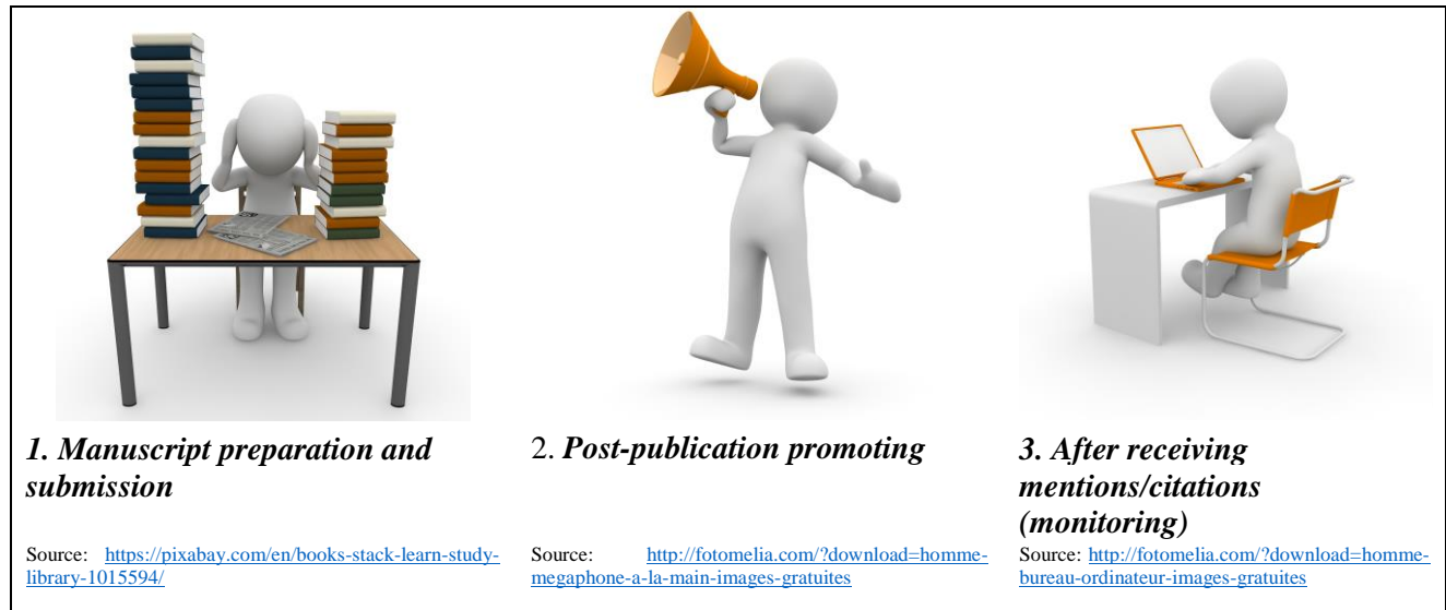
Figure 1 Three stages of the paper journey for promoting research outputs

future research impact and citations, for an example, the narrative style of writing may receive more attention compared to other styles [7].