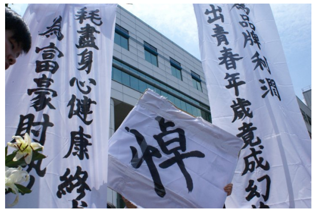
Taiwan unions and labor activists unfurl white banners to mourn the Young Foxconn workers in a protest against Hon Hai on 28 May 2010, Taipei. (Left) For wealth and power— physical and mental health spent, hopes lost (Right) For profit of the brand—youth spent, dreams shattered.

Foxconn employees experience long hours of repetitive work for very low income. They submit to management scrutiny on the job, and their low income and limited free time restricts their options outside of work. Many young men and women workers rarely stop working except to eat and sleep, simply to make ends meet. The result is a community of people under intense stress with few resources, a situation conducive to depression.