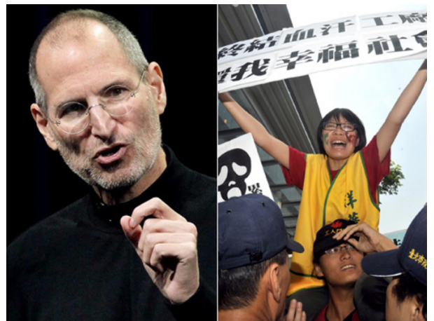
Will Apple and other corporate icons be able to distance themselves from the plight of Chinese workers assembling their products? Steve Jobs addressed the Foxconn issue at a press conference while a Chinese protester demanded equitable treatment for workers.

Apple, which enjoyed record profits amid the economic crisis, continues to seize every opportunity to secure lower prices from suppliers. Indeed, industry sources suggested that Apple awarded iPhone orders to Foxconn after Foxconn agreed to sell parts at "zero profit".<sup>99</sup> Foxconn probably agreed to the deal in order to keep other more lucrative Apple contracts and to kill its competitors. It offered a rock-bottom price made possible by its big market size to secure a leading industry position. Apple revenues for the fiscal 2009 first quarter exceeded US$10 billion.<sup>100</sup>