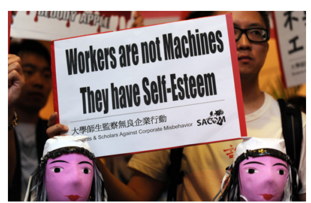
On 8 June 2010 the Global Day of Remembrance for Foxconn Victims and Foxconn's Annual General Meeting, student protestors from SACOM, Hong Kong labor unions, and rights groups demonstrated outside a local Apple store to hold Apple and Foxconn accountable to workers' rights.

working class. The use of a large pool of young migrant labor to fuel China's export-driven economy comes at too high a human cost. Migrant workers' basic needs for housing, social security, and education for their children are not protected by the local government. As long as these real problems are not solved, the mental or psychological problems that have been magnified will never disappear. The government should redistribute income and guarantee benefits to rural residents and migrant workers to improve living standards. Institutional discrimination against migrant workers, based on rural household registration and other policies, must be eliminated to facilitate labor mobility and reduce labor market segmentation and discrimination at the expense of rural workers. Workers' participation in social and labor reform will build the community resources to reduce suicides. Overall, a more balanced urban-rural development model is key to social and economic stability.