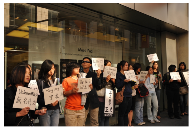
Thirteen young organizers picketed an Apple store in San Francisco on 17 June 2010. They carried placards showing the names and ages of 12 of the 13 Foxconn suicide victims whose names are known, and an unnamed placard for the 13th. They had a moment of silence for each of them. On the "DeathPad," reads "Workers want justice."

Workers-of-rural-origins are marginalized and excluded materially and culturally. Younger workers in particular feel insecure, neither belonging to the city nor able to return to a livelihood in the countryside. Every day, hundreds of young workers quit their jobs and leave the "walled city" of Foxconn. But those who hop to other factories quickly find themselves being exploited in more or less the same way as at Foxconn. Some have their employment histories brought to an end by industrial accidents.<sup>145</sup> Still others, under desperate conditions, have taken their own lives.<sup>146</sup>