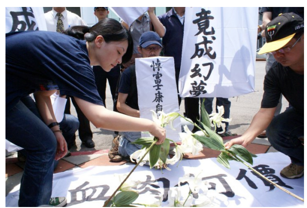
What is the price of a human body? Dozens of demonstrators protested outside Hon Hai's Taipei headquarters on 28 May 2010, urging the company to respect life and improve treatment of its workers. They laid flowers for the 10 dead Foxconn workers.

At the root-cause level, global brands such as Apple pressure suppliers like Foxconn to compete against each other on price, quality, and delivery. To secure contracts, Foxconn minimizes costs, and transfers the pressure of low profit margins to frontline workers. The pressure to keep up with new, competitively priced orders forces Foxconn workers to new levels of exhaustion.