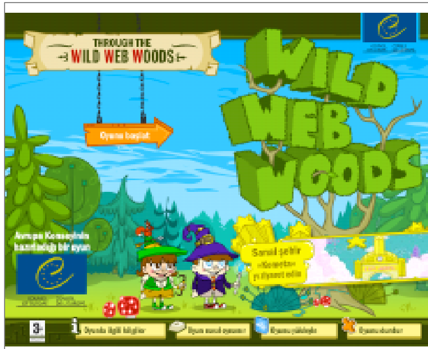
Figure 1: A screen shot from Wild Web Woods Game

This game was designed by Netzbewegung, German company, within the scope of a European Council program called “Construction of Europe for and with Children”. The basic purpose of the game is to prepare users for safe Internet use by informing them about unsafe situations likely to be experienced while using the Internet. The game has a support for 27 different languages including Turkish. Each task to be fulfilled in the two-dimensional game is assigned in the form of a scenario. The characters in these scenarios are taken from various children’s stories.