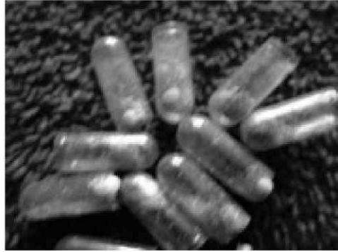
Fig. 3 (Left). Filling of the blended mixture of eggs of C. carnea and food in capsules. Fig. 4 (Right). Pupae of C. carnea in the capsules.