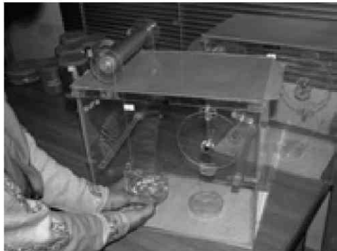
Fig. 5 (Left). Emergence of adult moths from pupae in capsules. Fig. 6 (Right). Releasing adult moths emerged from pupae in rearing cage.