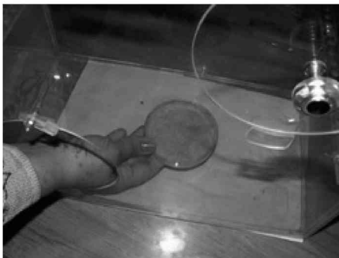
Fig. 8. Petri dish containing water soaked cotton in the cage

Many scientists (FINNY 1984, HAGEN 1950, HAGEN and TASSEN 1970) reported the successful rearing of Chrysoperla carnea . They emphasized on the development of diet for its mass rearing. FINNY (1948) reared it in wooden cage on honeydews of Pseudococcus citric . Later on the wooden cages were provided with black organdy top as substrate for egg laying and hydrolysate of yeast was used as adult food (FINNEY 1950). An anesthesia of carbon dioxide was recommended to shift the moths from one cage to another for sanitation purpose (HAGEN, 1950) GAUTUM (1994) used round transparent jars with black organdy at the top opening for egg collection and used vacuum sucker for shifting the moths from one jar to another.