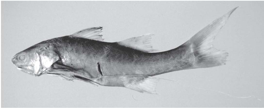
Fig. 1. Lectotype of Polydactylus macrophthalmus Bleeker, 1858, RMNH 6015, 129mm SL, Palembang, Musi River, Sumatra, Indonesia

The osteological characters were confirmed from X-ray photos taken of all specimens. The swimbladder was confirmed from MNHN 1891-571, ZMA 114.431 (215 mm SL, 1 of 3 specimens) and ZMA 114.432, abdomens of these being already dissected. Institutional codes follow Leviton et al. (1985), with an additional institutional abbreviation as follows: Division of Fisheries Sciences, Miyazaki University, Japan (MUFS).