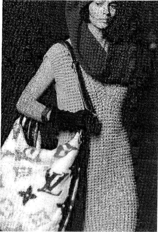
Photo 2: Models for Louis Vuitton's prêt-à-porter collection often grace the runways carrying the newest Louis Vuitton bags.

The idea of Louis Vuitton's entry into prêt-à-porter articles—decided by Bernard Arnault, the president of LVMH—is to spark rethinking of the brand through clothing, cycling back into basic sales of the handbags.