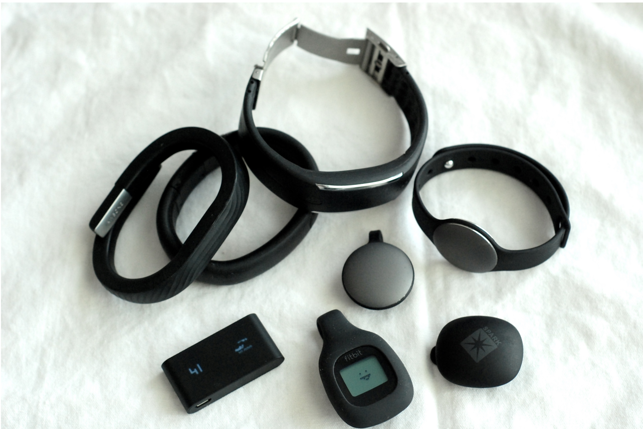
Figure 1. Wearable fitness trackers. Top L-R: Jawbone UP24, Nike Fuelband, Polar Loop, Misfit Shine with sport band . Centre: Misfit Shine with action Clip. Bottom L - R: Withings Pulse, Fitbit Zip, Spark Activity Tracker.

via a separate mobile device or personal computer. We considered a device to be a wearable activity tracker if it contained an accelerometer and connected with a mobile platform. The device also had to be able to be wirelessly paired with handheld or desktop computers with at least Bluetooth 2.0 and be compatible with either Android 1.6+ or Apple's operating system iOS 6.0+. The following wearable activity trackers were evaluated for BCT content: Misfit Shine, Fitbit Flex, Jawbone UP24, Withings Pulse, Nike+ FuelBand SE, Polar Loop, and SparkPeople (Figure 1).