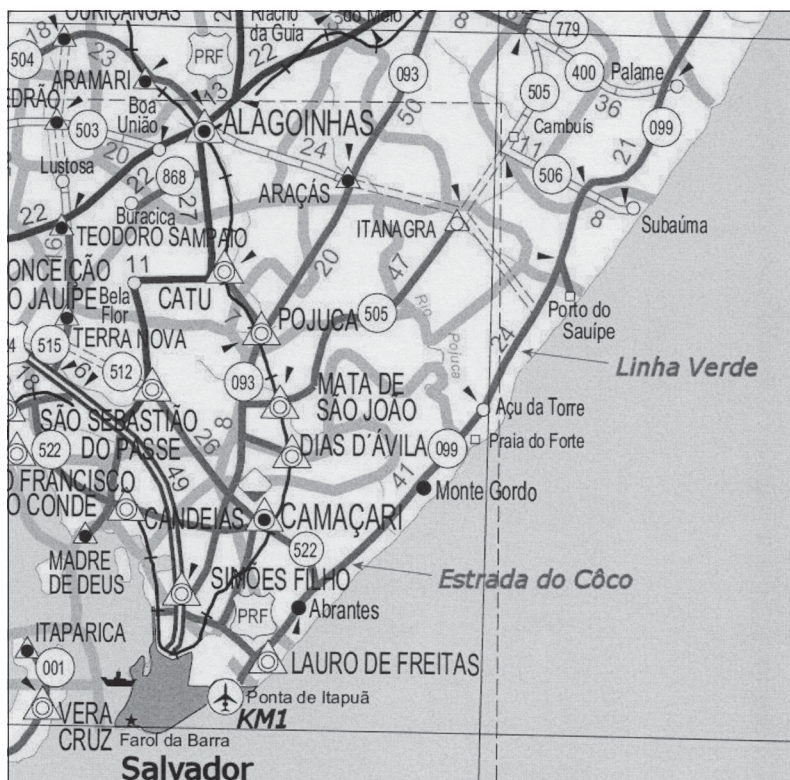
Figure 1 Map Praia do Forte

Figure 1 shows the location of Praia do Forte and a segment of the Coconut Coast region (which extends from Salvador to the northern border of Bahia with the state of Sergipe). The map also shows the location of the BA-099 Highway ( Linha Verde ), which was built to facilitate access from Salvador to the coastal communities and beach destinations. The beaches of Praia do Forte are important feeding and reproduction sites for four species of sea turtles: Caretta caretta (loggerhead), Eretmochelys imbricata (hawksbill), Lepidochelys olivacea (olive ridley) and Chelonia mydas (green) (TAMAR Project-PF 2009). The TAMAR research station of Praia do Forte, established in 1982, also serves as the national headquarters for TAMAR. When the station opened, tourism was at its infancy. The visitor centre, which opened a few years later, was built in response to the growing number of tourists interested in seeing