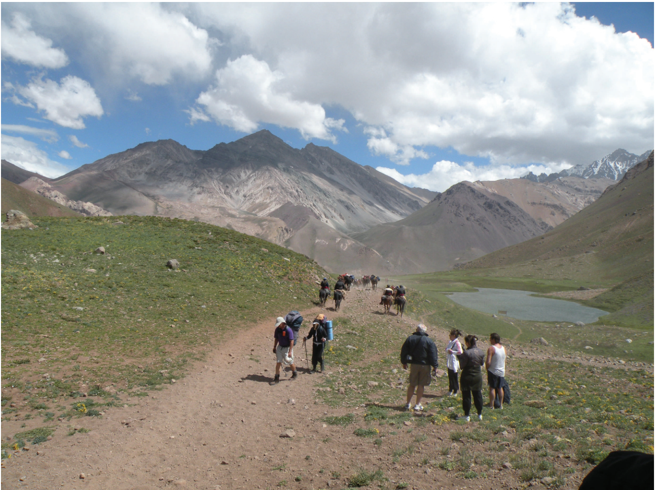
FIGURE 3 Trail use by visitors and pack animals in Horcones Valley, Aconcagua Provincial Park, Mendoza, Argentina.

Reduced propagule pressure at higher elevations, more remote areas of park, or both may also be limiting the spread of non-natives farther into the park, as has been found in other regions (Pauchard and Alaback 2004; Pauchard et al 2009; Speziale and Ezcurra 2011). Paralleling reduced propagule pressure is reduced disturbance by trampling by tourists and by trampling and grazing by pack animals of the natural vegetation higher and farther in the park, which is also likely to be restricting the establishment and spread of non-natives. The relative importance of these factors is difficult to determine, because they are all correlated with elevation, as has been found in other research that examined non-native species distributions along a gradient in the Patagonian Andes (Pauchard and Alaback 2004).