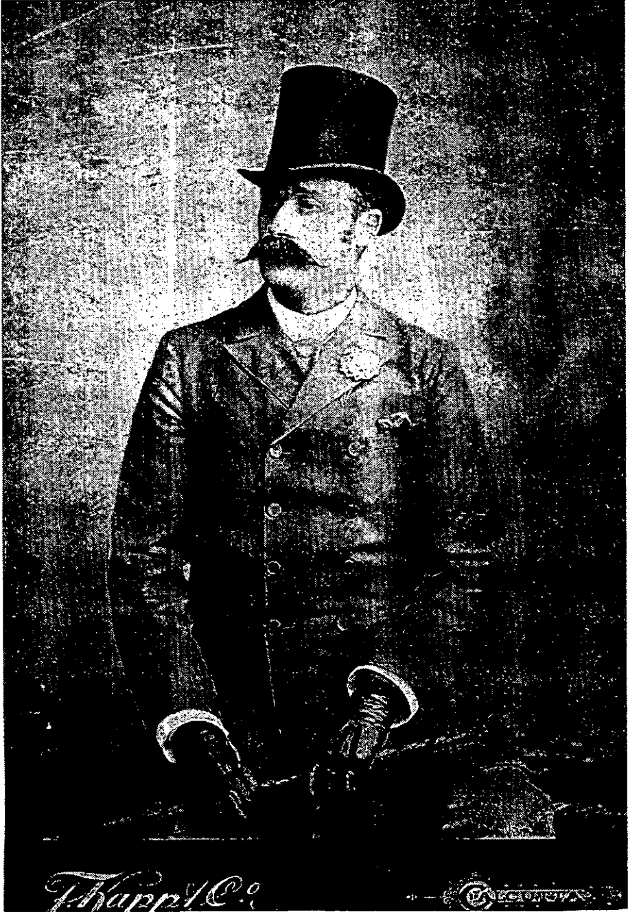
Park Van Tassel (1852–1930), dressed as the consummate showman. Photo taken in India in 1892, courtesy of Rick Van Tassel.