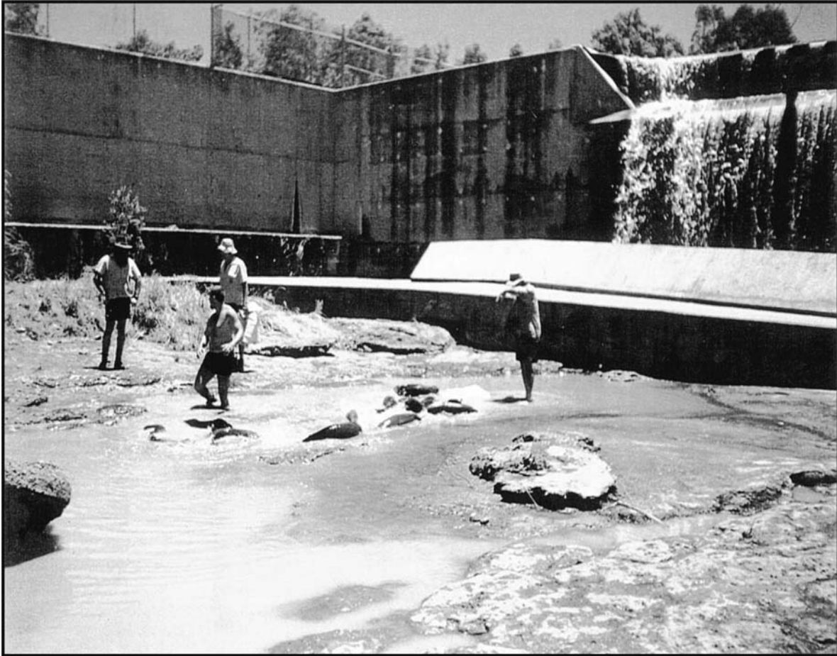
PLATE 1. An example of loss of ecological goods provided by rivers: fish stranded below weir by rapid fall in water level.

dependent upon the timing and pattern of stream discharge, as well as serve as an “umbrella” flow target to protect species and processes as yet unstudied; (5) the method is intended for application to classes of streams that represent the substantial variation in climatic, physiographic, and ecological conditions prevailing at regional or national scales, and can therefore produce regional environmental flow guidelines.