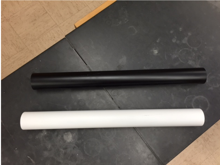
Figure 3. The black and white poles used for the experiments in the pool