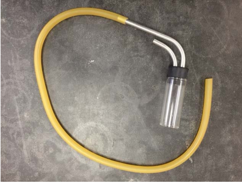
Figure 1. The aspirator used to collect ants in the field.