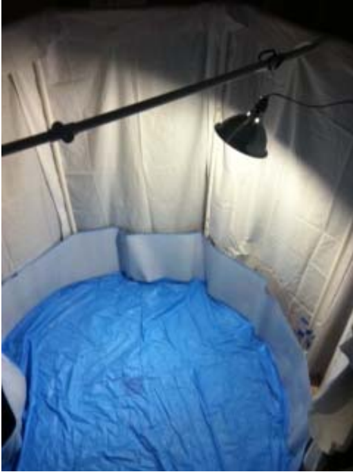
Figure 2. The pool used for the lab experiments (shown without water in this case)