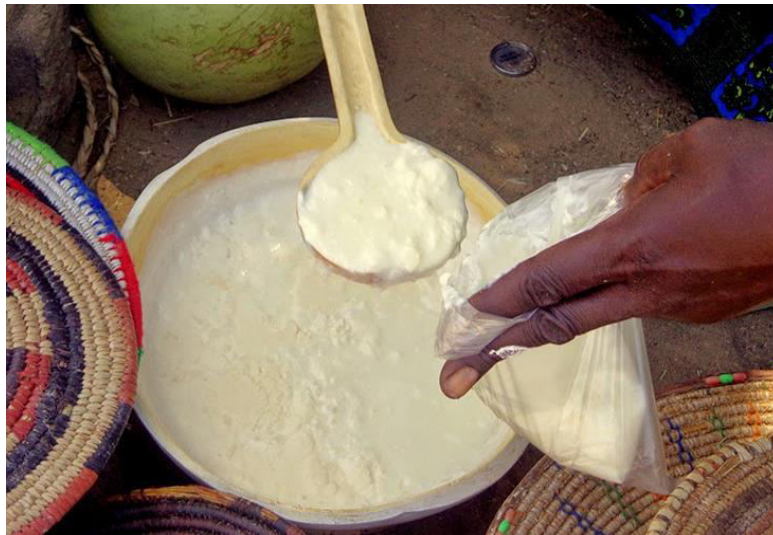
Figure 1. Fulani woman displaying nono (Dobby's Signature.com, 2014).

Common bacterial flora of fermented milk are the Lactic Acid Bacteria (LAB) which among others comprises of Lactobacillus lactis , L. bulgarius , L. helvericus , Leuconostoc species, Streptococcus thermophilus , S. lactis and S. cremoris ; as well as the Propionic Acid Bacteria (PAB). Most coliforms inhabit the intestines of warm-blooded animals and are shed along with their faeces to living environments. Many other food borne pathogens equally originated from faecal contaminations (Congan, 1995).