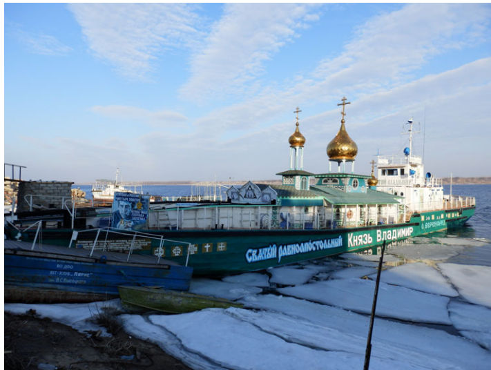
FIGURE 6 The Saint Vladimir by its winter station. [Colour figure can be viewed at wileyonlinelibrary.com ]

obtained a decommissioned landing craft from a shipyard near Saint Petersburg. The complex conversion took almost two years, yet the result was truly spectacular. A local artist worked closely with Koretsky to decorate the floating church with an impressive collection of icons, religious motifs, scenes from Vysotsky's career and even an illustrated narrative of the floating churches (Figure 6). The flagship of the "flotilla for God" received the name of Saint Vladimir and was consecrated in October 2004 by the Volga embankment, where the festival of bard songs is held each year. During its maiden voyage, it reached Saratov to the north and Astrakhan to the south, stopping by every village and town to provide religious services. While mooring in major cities, once the Liturgy was celebrated aboard, Koretsky would hold charity recitals, performing Vysotsky's repertoire. In an interesting twist, almost a century after the Saint Nicholas steamer took its first Volga journey, another floating church was visiting Astrakhan, carrying sacred relics and the lyrics belonging to one of Russia's most beloved bards.