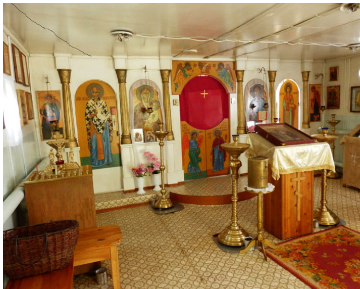
FIGURE 4 The Saint Innocent's iconostasis and nave. [Colour figure can be viewed at wileyonlinelibrary.com ]

entwined with the social and religious life aboard ship and around mooring sites (Della Dora, 2010; Peters, 2012). From the regular interactions with other ships to the staging of religious rituals, its mobility enhanced the “experience of travel and learning” (Della Dora, 2010, p. 484). As indicated by the crew, serving on the Saint Innocent proved very demanding. The priests were confronted with totally different dynamics compared to regular orthodox parishes, having to cope with the changing conditions and shifting spatialities of Volgograd’s riverscapes: