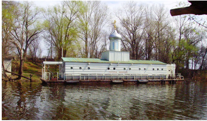
FIGURE 3 The Saint Innocent at a mooring site. [Colour figure can be viewed at wileyonlinelibrary.com ]