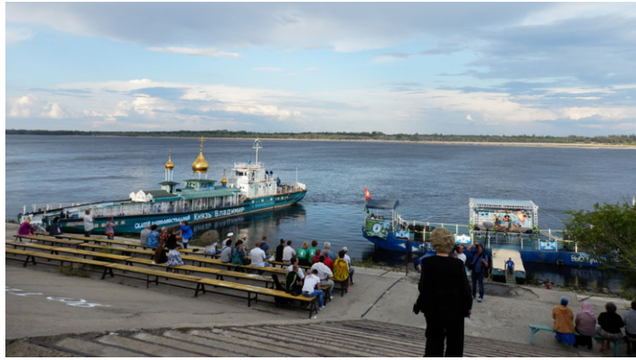
FIGURE 1 Preparations: the Saint Vladimir (left) and the floating festival stage (right). [Colour figure can be viewed at wileyonlinelibrary.com ]

and the function it performed, we enquired about its story and learned that, apart from its religious function, the floating church served as a mobile stage for charity concerts, as well as an open canvas for various artworks. Yet, we soon realised that the Saint Vladimir was not the only ship of its kind in the Volgograd oblast, 1 where there existed a legacy of what many described as the “flotilla for God”. 2