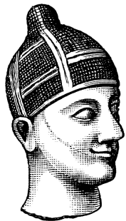
Stone head from Golgoi.