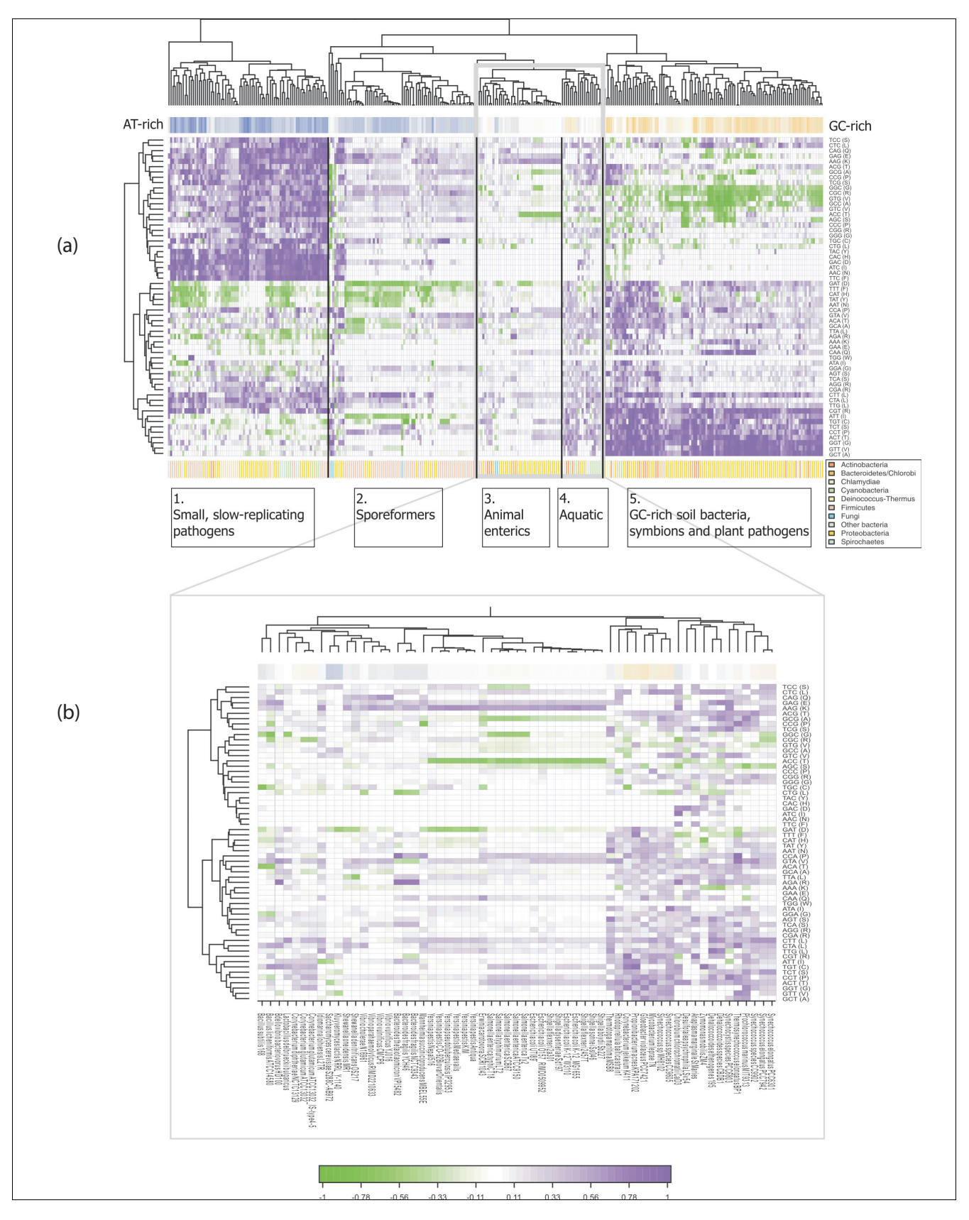
Figure 2 (see legend on next page)