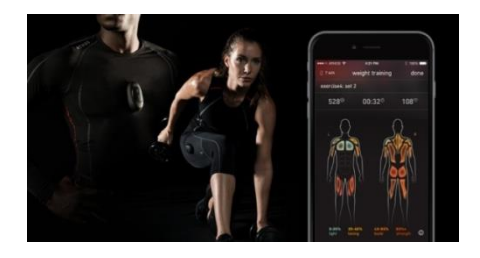
Figure 5. Athos sweat-wicking base layers [14].

Biometric measurement clothing takes an important role for evaluating and tracking the performance of athletes by monitoring biometric data and vital signssuch as heart rate, breathing rate, activity intensity, steps, muscle effort and calories burned. Several companies produce biometric clothing such as Athos [14], OM Signal [15] and Hexoskin [16]. According to the manufacturer, the Athos base layers track muscle effort, muscle target zones, muscle fatigue, heart rate and breathing patterns, helping athletes to understand how their muscles are contributing to the movement (Figure 5).