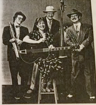
Wholly Cats will appear at the Annual Banquet.

7:30 PM Annual Banquet — Columbia River "GORGE" Night