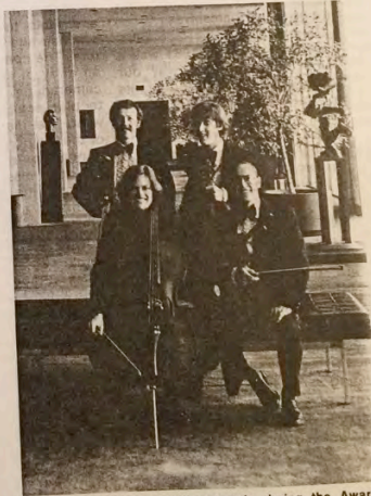
The Stradivari Strings will entertain during the Awards Reception.

You are invited to meet and greet the 1983 award recipients and listen to the harmonious melodies of the Stradivari Strings Ensemble during the Wine and Cheese Reception.