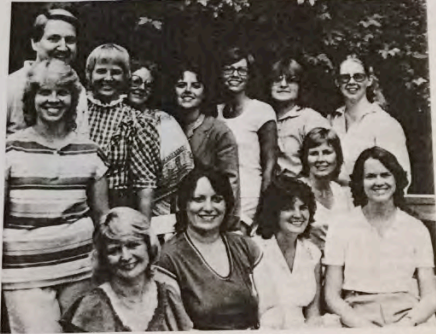
Portland Conference Committee

The following 7 photographs are conference materials from 63rd Annual AOTA Conference held in Portland, Oregon. They are included here to provide a specific example of the conference happenings, meetings, and special events.