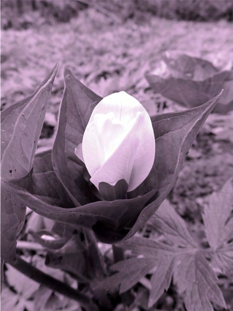
Budding Flower.