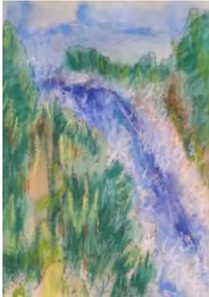
Waterfall.

occupational therapy journey, take advantage of it. She has seen and experienced many things over the past 39 years and you may still see her applying the basic principles of OT in her daily life volunteering at the food bank, knitting hats for the homeless, and facilitating activities with her Yurt Group. Perhaps you will even have an opportunity to join her when she herself is participating in an activity in one of her favorite roles (self described) as a mother, wife, grandmother, and brand new great grandmother.