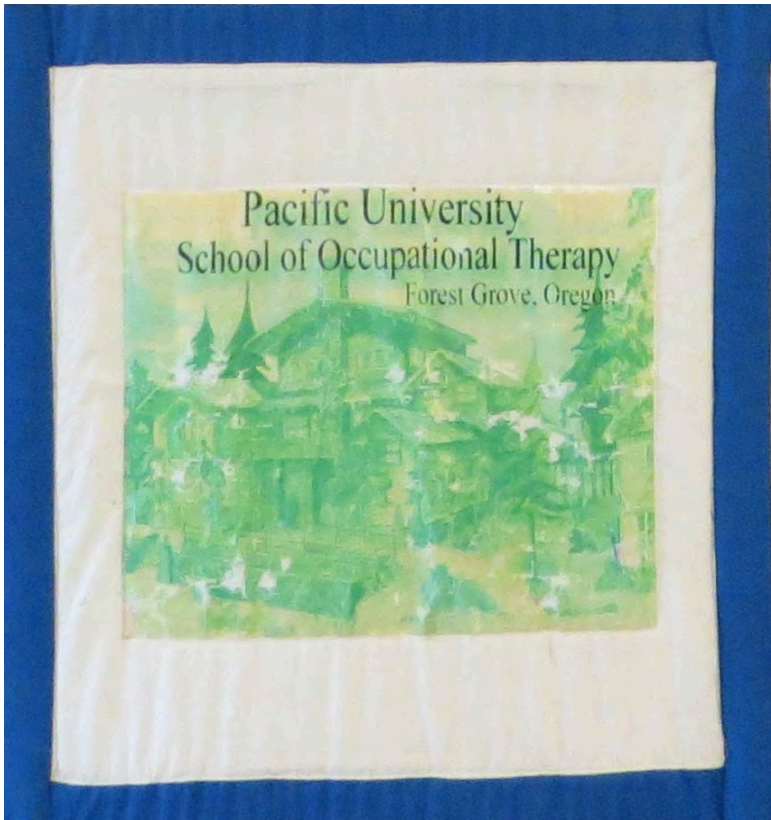
Pacific University School of Occupational Therapy Square