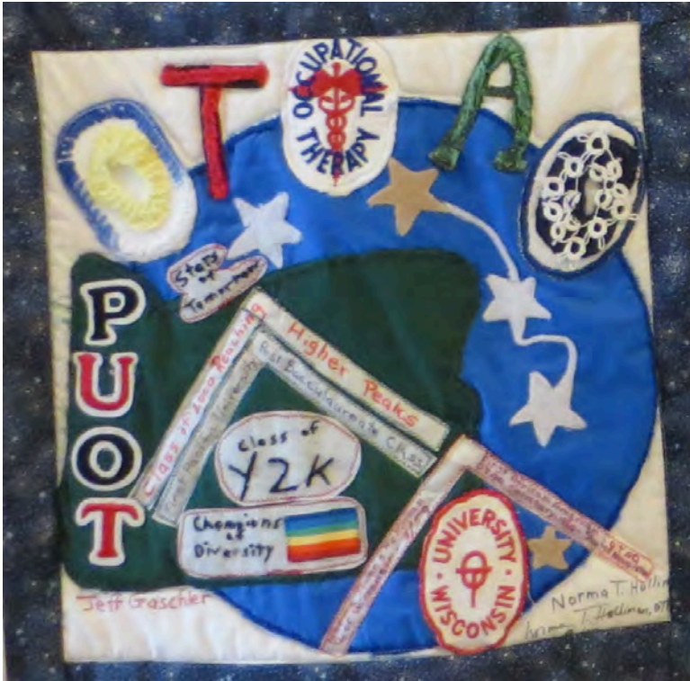
Row 6 (Left to Right)