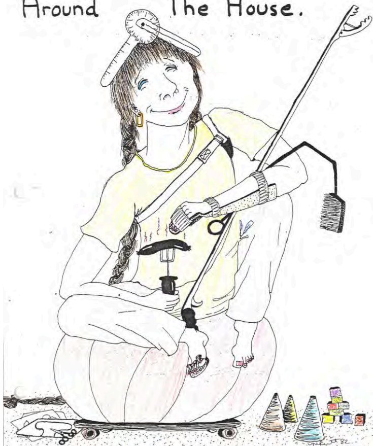
OT Sketch from 1982, from OTA0 Publication.

The below information is included for reader's to understand the many efforts OT educators made to advance leaders in the profession. Oregon OTs understood the profession needed to move forward and this was their response to that need. Although successful, the program was short-lived due to low enrollment at the COTA school and the future development of an OTR career track (non-existent in Oregon until the mid 1980's).