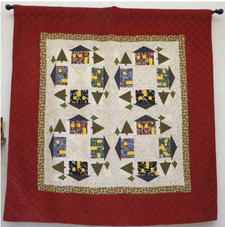
Teresa Fairfield Quilt. Pacific University School of Occupational Therapy.