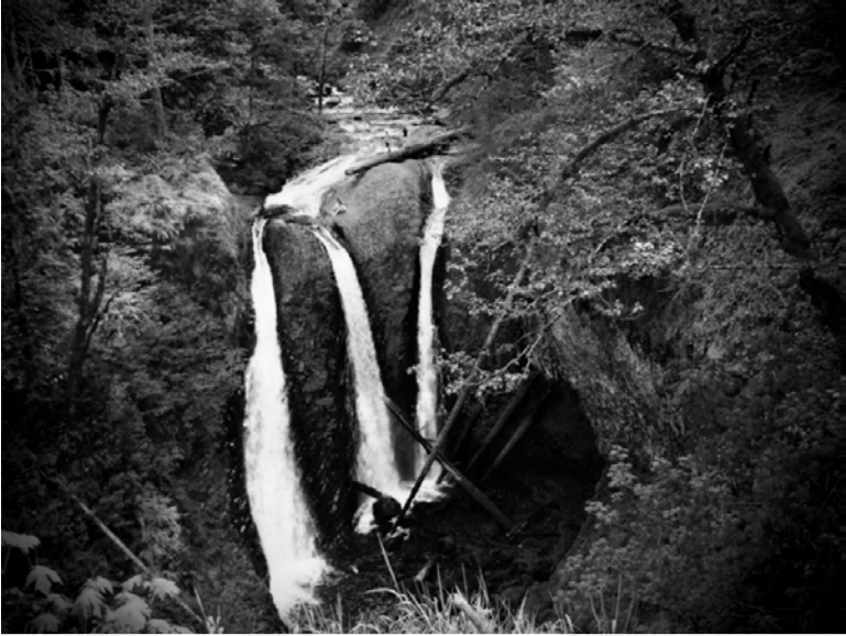
Waterfalls in the Columbia Gorge.