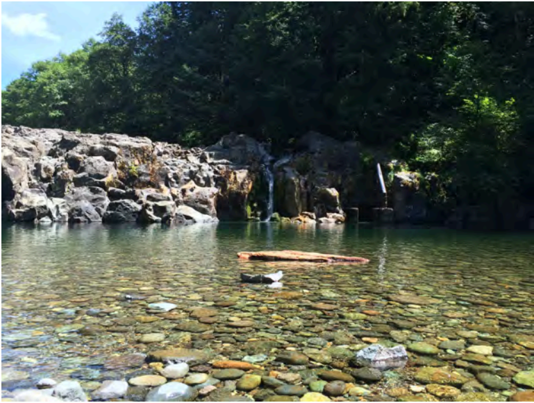
Opal Creek (near Lyons, Oregon).

“I have always enjoyed capturing the pure beauty of Oregon in pencil sketches and photography. Living in this gorgeous part of our country is something I am consistently grateful for. Connecting with nature makes me feel peaceful and alive.”