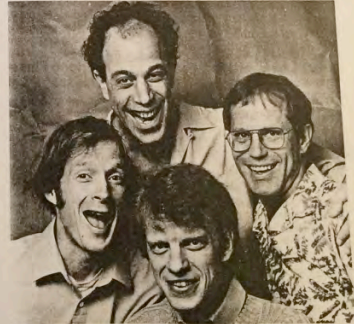
See the Metropolitan Jug Band at the Columbia River "GORGE" Banquet.

Swing and dine at the Red Lion Hotel to the sounds of the Wholly Cats during your Northwest "salmon bake" feast. After dinner, foot stomp to the music of the Metropolitan Jug Band and swing your partners to the calling of the Fun-lovers Square Dance Club of Portland. No single physical feature has influenced the development of the Pacific Northwest more than that of the Columbia River. Transportation is included in the cost of your dinner so you can explore the great, majestic river of the Northwest as you travel down its channel viewing its sparkling waters, city bridges, and the night lights of the City of Portland.