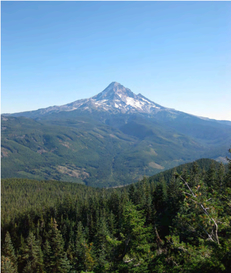
Mt. Hood.