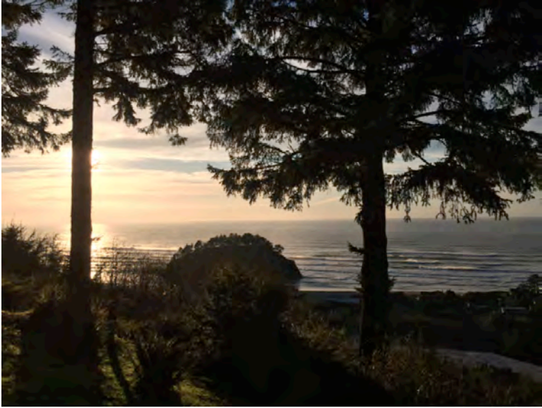
Pacific Ocean (near Neskowin, Oregon).