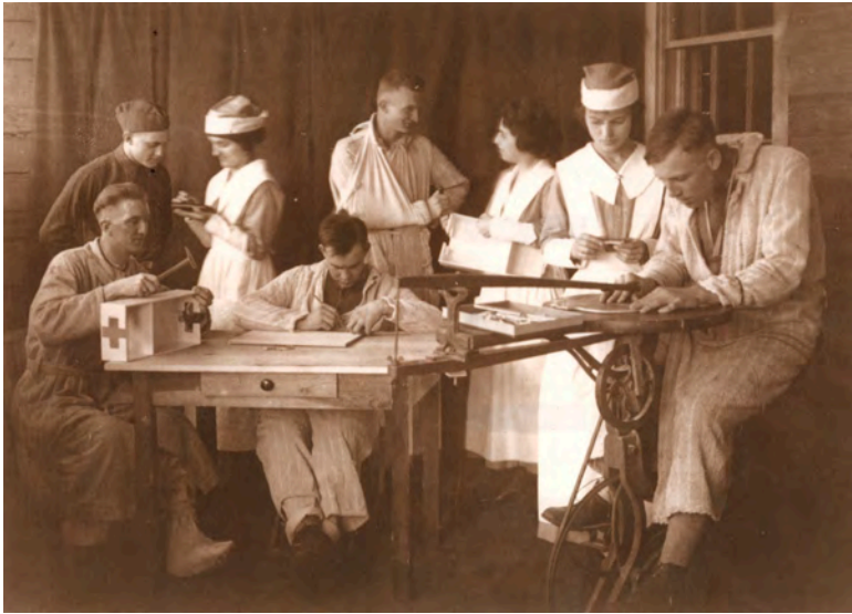
Reconstruction aides supervise recovering servicemen in craft activities in the early years of World War I.