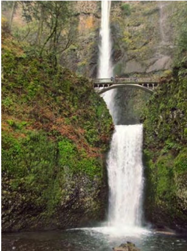
Multnomah Falls.

“Photography has played a significant role in my life since I was a young child learning how to shoot photos with my father in the northern Minnesota wilderness areas. I continue to find enjoyment capturing the stillness, beauty, and joyful expression of nature in all landscapes I visit.”