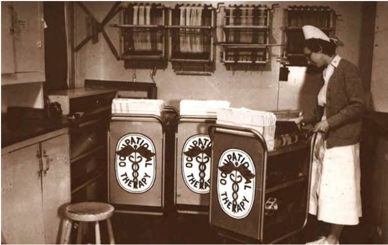
Mobile carts bearing the OT insignia carried therapeutic activities to the bedside in a World War II military hospital. © AOTA, 1992 calendar. Used with permission.

The following list of OT Programs provides a glimpse into how far our profession has come from a national perspective. According to AOTA, there are now 14 accredited doctoral (OTD) programs, 167 accredited master (MOT) programs, and 229 accredited certified OT assistant programs.