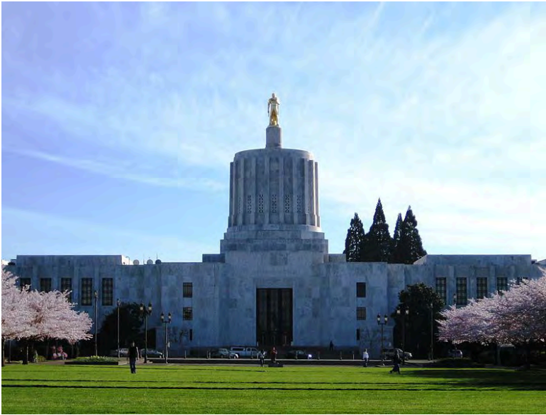
Oregon State Capitol Building.