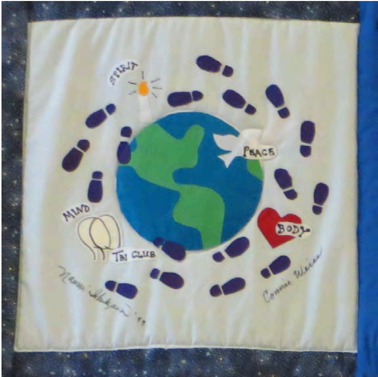
Row 4 (Left to Right)