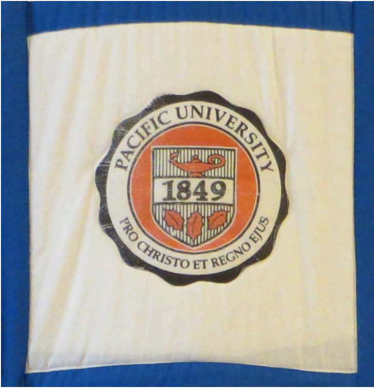
Pacific University Official Seal