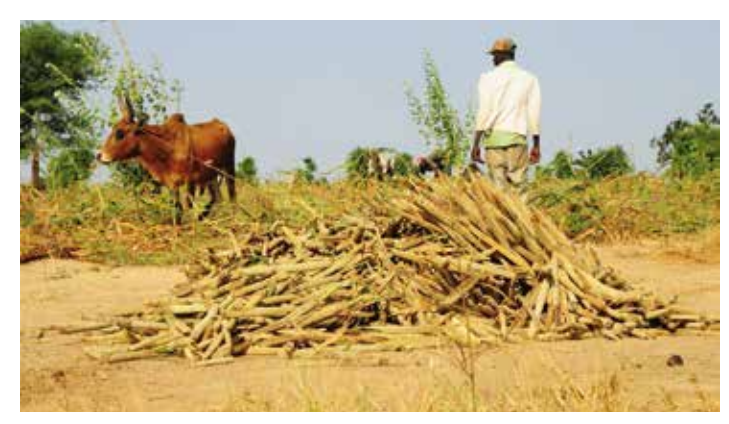
Fig 3. An adaptation strategy - Bouyawere farmers have adopted a millet variety that has a shorter maturity period than Toronion

The opinions of farmers, who are most concerned with climate change, should be taken into account.