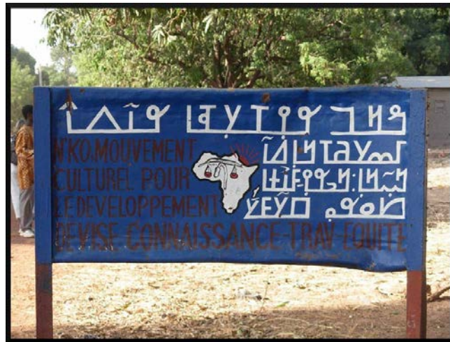
Figure 5. Bilingual sign for N’ko school in Mali.

is used in, unlike the Cherokee script which is officially funded and supported by the Cherokee Nation since 1991. 49 50 Statistics from Kankan, Guinea in 1994 suggest that N’ko literacy was roughly equivalent with Arabic scriptural literacy at the time, with about ~8.5% of the population reporting functional literacy in N’ko. 51 This is significant, considering that madrasahs had been established in Guinea starting in the 11 th century while N’ko had only existed as a script for fifty years, and even more significant when one considers that literacy for the entire city of Kankan has hovered around ~20-30% for the last twenty-five years, showing that half to one-third of all literate people were in fact using N’ko as one, not necessarily the main, means of written communication.