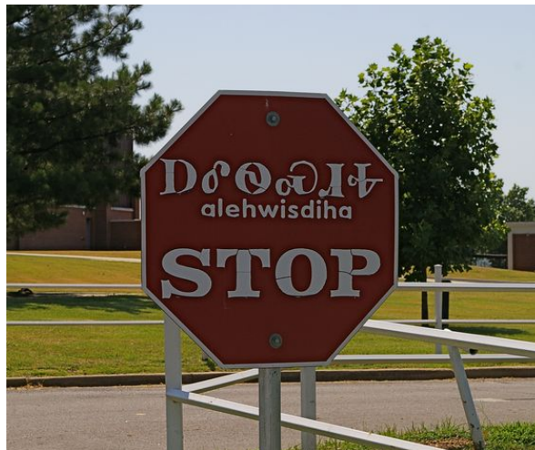
Figure 4. Bilingual Stop Sign in Tahlequah, OK with transliteration.

During the period 1906-1971, when the official Cherokee Nation was decommissioned and without leadership the syllabary was still used to educate Cherokee people- even with government programs to discourage Cherokee-language education. 40 It was not until 1991 that the syllabary was legally encoded into the linguistic landscape of the Cherokee Nation- that is, formally promoted in public writing- and Cherokee was recognized and protected by the tribal government as a cultural resource. 41 The language, in addition to being taught in immersion schools throughout the reservation, is prominent on signage and businesses, making the visibility of specifically Cherokee culture in eastern Oklahoma impossible to ignore. 42