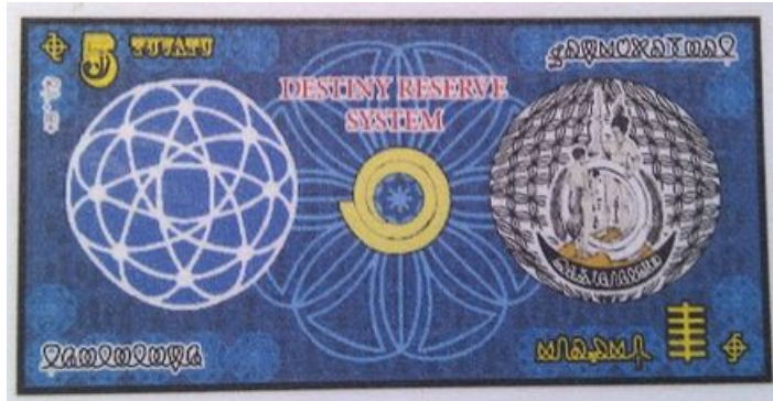
Figure 6. Five Tuvatu banknote from Tangbunia. Note sandroing and boar tusk imagery.