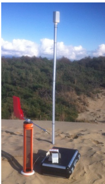
Figure 2. The Sand Collector Node (on the left) and the Sand Level Node (on the right)

The proposed architecture was tested in March, 2016 on the sand dunes located in the San Rossore regional park, Pisa, Italy. For the tests, 5 nodes WSN was set up: this included three Sand Level Nodes , one Sand Collector Node and one Environmental Monitoring Node . The three Sand Level Nodes were arranged in line, perpendicularly to the beach, 10 meters apart from each other. The Sand Collector Node was positioned close to the top Sand Level Node. The Environmental Monitoring Node was positioned on the top of the sand dune 5 meters apart from the top Sand Level Node. The Gateway Node was positioned close to the Environmental Monitoring Node.