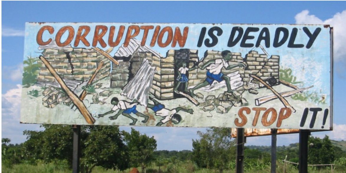
Image Credit: Anti-corruption sign, Uganda ( futureatlas.com CC BY 2.0)

Definitions of corruption don't vary dramatically. The World Bank and the International Monetary Fund share one: 'the abuse of public office for private gain'. Transparency International: ' the abuse of entrusted power for private gain '. The African Development Bank: ' the misappropriation of public assets or public office and trust for private gains '. The Organisation for Economic Cooperation and Development: ' active or passive misuse of the powers of Public officials (appointed or elected) for private financial or other benefits '. The Asian Development Bank includes private office along with public office: ' the abuse of public or private office for personal gain '. All the major definitions get at precisely the same idea, with the last definition slightly different in an important way – it brings in the private sector.