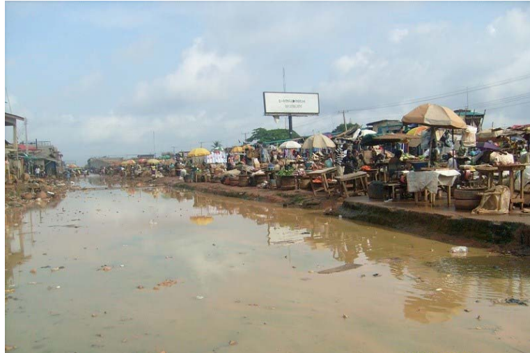
Fig. 6: Major Road in Ota, Ogun State, taken over by flood