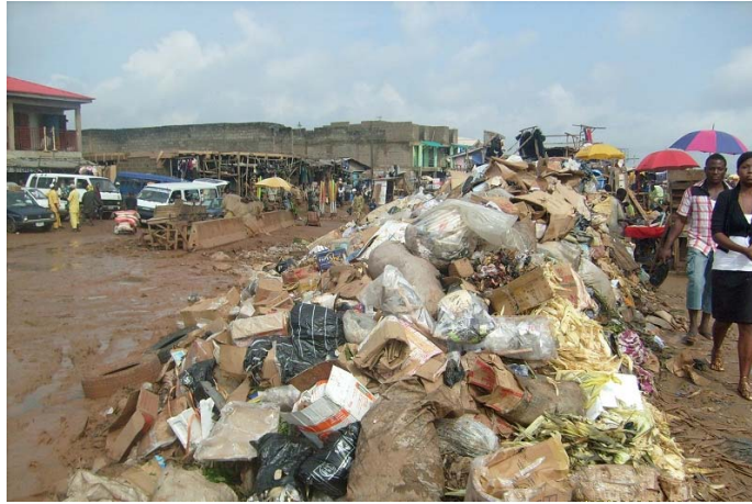
Figure 3: Solid waste dump and land pollution in city center of Ota, Ogun State