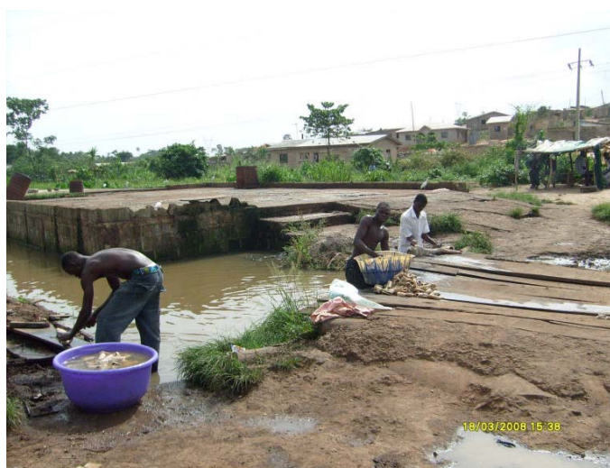
Figure 5: Surface water pollution at a Public Abattoir

b WHO acceptable level for Groundwater quality