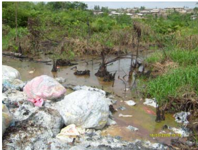
Figure 2: Solid wastes dumped into a stream channel in the coastal city of Ota.

The amount of waste generated from households and commercial establishments are on the increase at an alarming rate and the wastes are not being collected and disposed in a manner that would protect the health and safety of the public. These abandoned wastes create nausea, eyesores and a good breeding ground for germs and bacteria right in the city centers. Visitors, investors and tourists visiting these areas for the first time would likely find the sceneries completely repulsive and offensive. Some of the factors responsible for this unsocial and irresponsible habit of unsanitary waste disposal can be attributed to overpopulation, poverty, government insensitivity, government negligence and ignorance on the part of the populace. Many who were born and live under these unsanitary conditions for years have come to accept the situation as the norm thus perpetuating the problem.