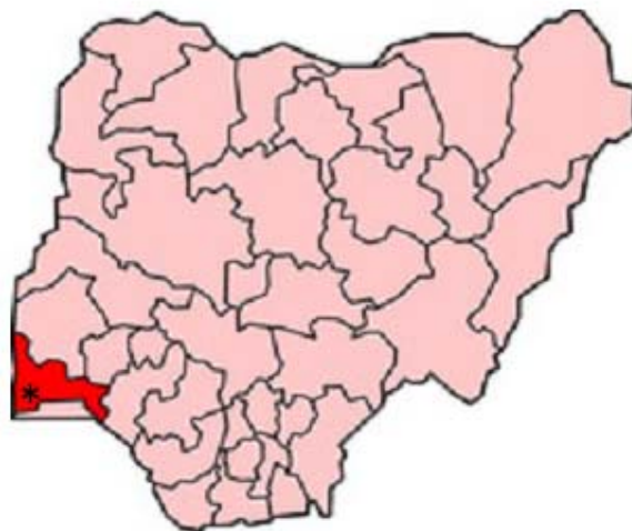
Fig. 1b: Location of Ota in Ogun State