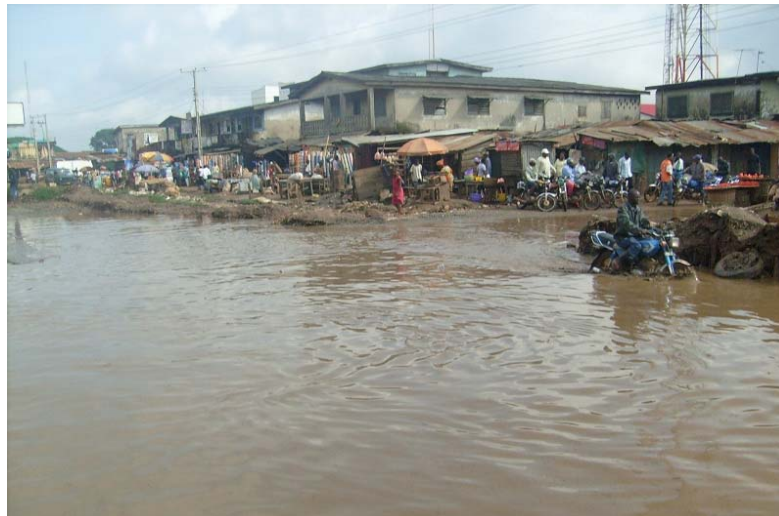
Fig. 7: Flooded roads and homes in Ota, Ogun State