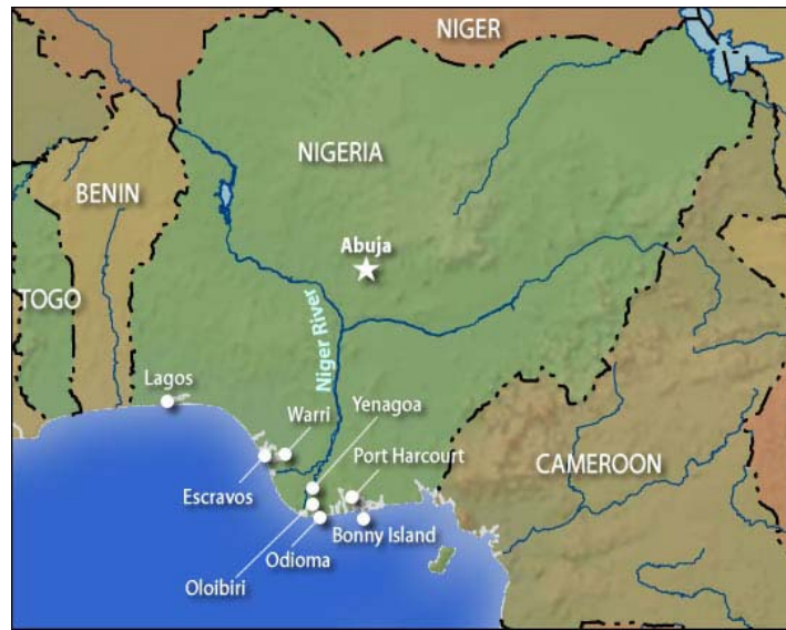
Fig. 1a: Map of Nigeria showing some Niger Delta communities, Lagos, Atlantic Ocean, and neighbouring countries.