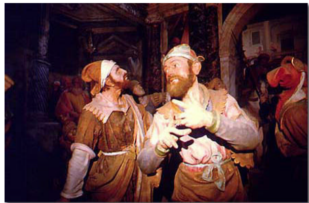
Ill. 1: Ferrari, Sacro Monte di Varallo, 1518-1522.

highly emotional, even ecstatic, representation of events send out a forceful appeal to the observer. In this work, Ferrari is completely in agreement with contemporary art theory, which viewed mental fervour ( moto: Lomazzo ) in particular as the basis of artistic creation. At night, the chapels were lit by torches, which further enhanced the illusion of living impressions. This example of a Mixed Reality used all means available at the time to create the deception of real presence with the effect that the monks, who guided the pilgrims around the complex, were constantly obliged to remind the visitors that this was not the real Jerusalem. It was so successful that in the following years a whole series of Sacri Monti were constructed and opened, not least with the aim of erecting an image wall against the approaching Reformation. These media dinosaurs then spread from Italy to France, Portugal, Spain, Mexico, and finally, even to South America.