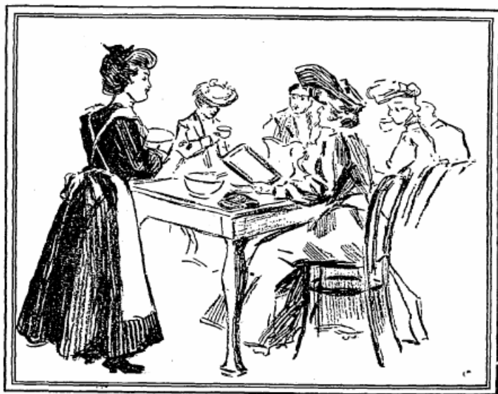
During Shopping Hours.

The growing number of women diners encouraged entrepreneurs to open restaurants that catered exclusively to women. In 1893, one of the first lunch counters solely for women opened