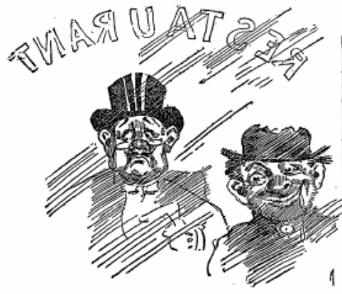
Figure 2: "Two Things Interfere With the Enjoyment of Food, Too Much Money and Too Little," 1913 ( New York Times )

“Two Things Interfere with the Enjoyment of Food, Too Much Money and Too Little.” 81