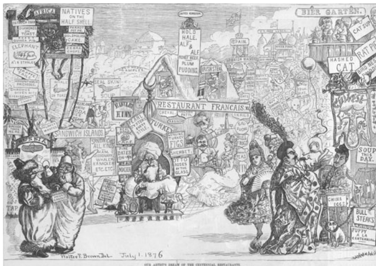
Figure 4: Walter Brown, “Our Artist’s Dream of the Centennial Restaurants,” 1876

A few months after the fair opened, Harper's Weekly published a special supplement dedicated to the Centennial. Slipped among the etchings of Centennial buildings was a sketch by