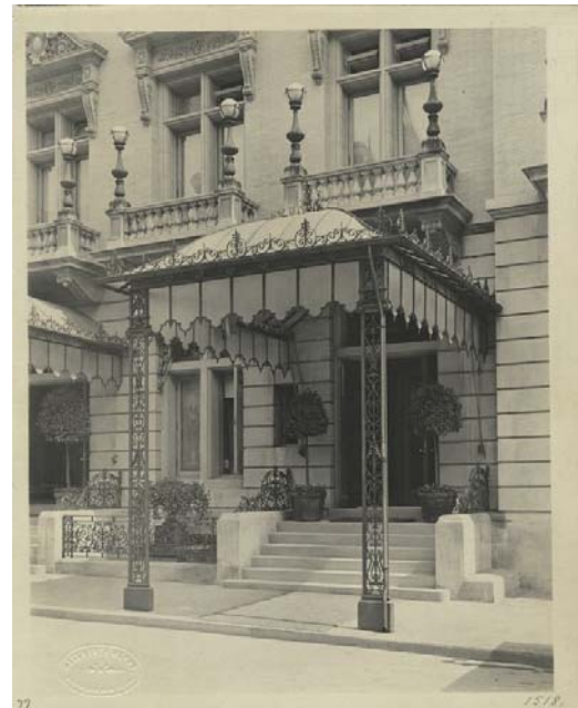
Figure 1: Delmonico's 1908

menu and acquired the services of Charles Ranhofer, a French-born and Paris-trained chef who would soon become America’s most celebrated cook. 26 “The opening of the Fifth Avenue