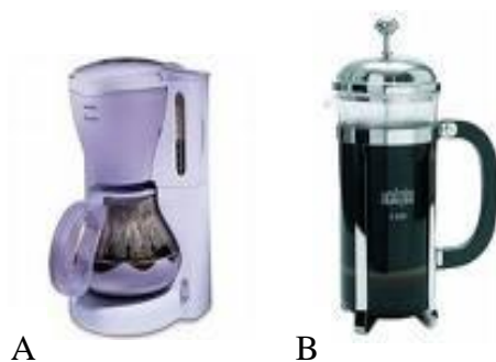
Figure 1. Coffee makers: (A) electric coffee maker (filtration system), and (B) piston machine.

OTA has also been extracted with cold water. Thirty grams of coffee were placed in the presence of cold water for 24 h. In each case, the beverage (20 mL) was used as extract and diluted with 80 mL of PBS then passed through the IAC.