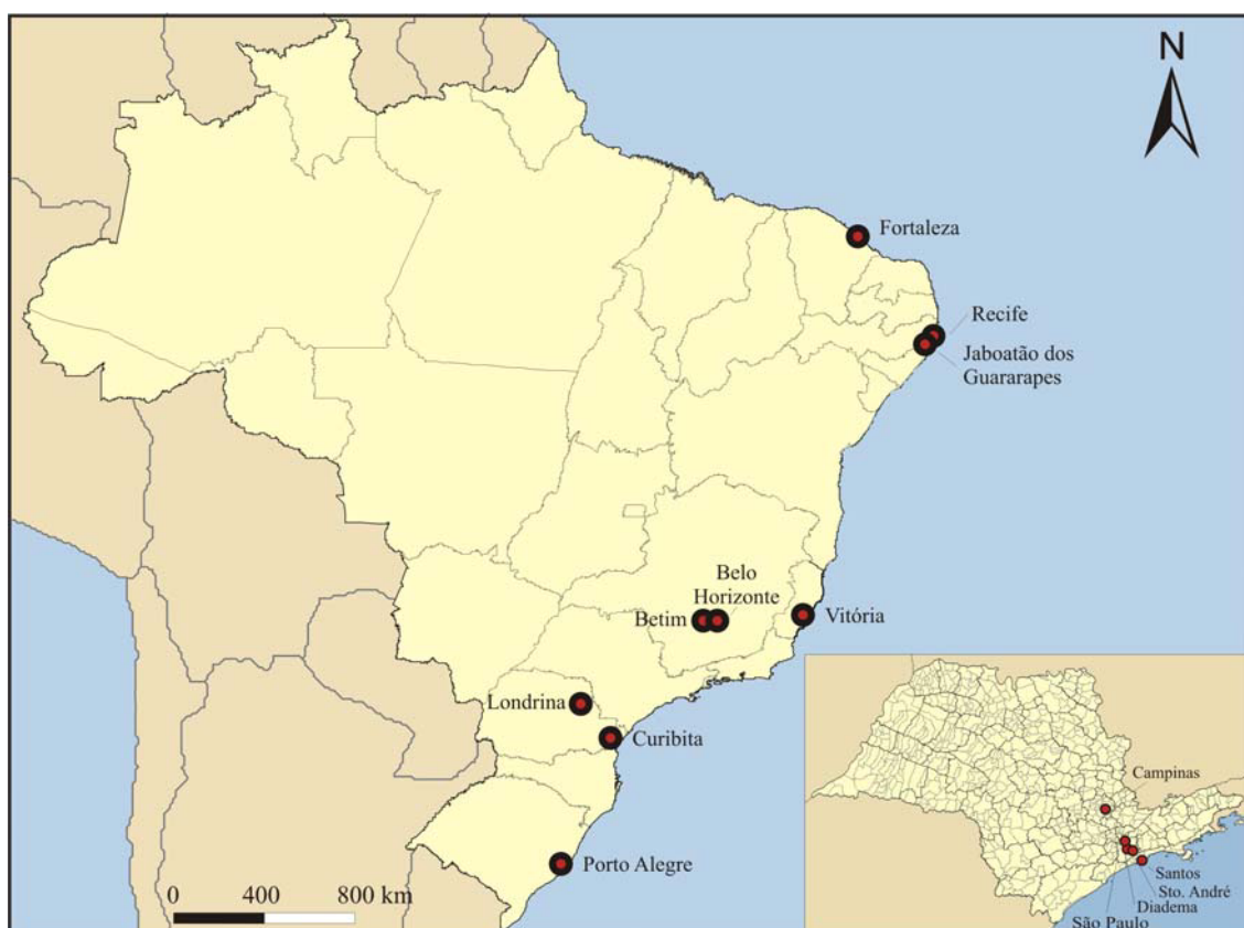
Figure 3 – Territorial distribution of some successful projects of urban management

Although the projects analysed are generally scattered across the Brazilian territory, it is necessary to advise that the municipality of São Paulo is dominant with two projects. As a Metropolitan Region, São Paulo solidifies its prominence, answering to its position as the leading “slums” area in the entire Brazilian territory. The absence of projects in the city of Rio de Janeiro (where Brazil’s second largest concentration of “slums” is located) is another important aspect of the analysis recognized by this paper’s authors as an important methodological flaw. The projects territorial distribution is displayed in Figure 3.