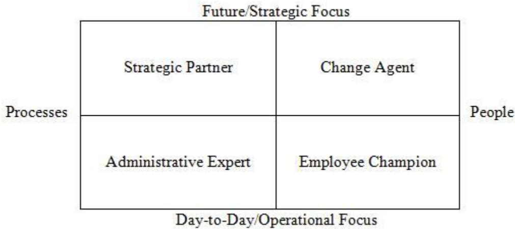
Figure 2-1: Ulrich's HR Business Partner Model