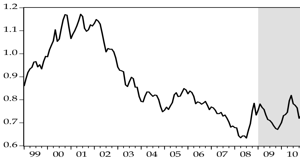
Figure 1. The euro - dollar exchange rate: 1999M01 - 2010M11

Notes: The shaded area represents the period of the Fed's embarking on quantitative easing.