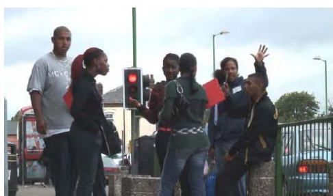
Figure 1 : A street survey with Youth Service