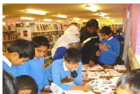
Figure 2 : Consultation activities with Canterbury Cross School children