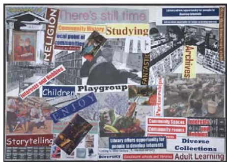
Figure 4 : Collages in Connecting Histories