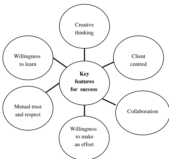
Figure 5 : Features for success in consultation

Does creative consultation work effectively for library services? Involving the community in decision making and in delivering services that meet the needs of communities isn't the easiest option. (MLA, 2006, p.4) However, the advantages can be worth the effort, as the two successful examples mentioned above. Here, the authors will point out the key elements that contributed to the success in conducting consultation processes according to the study of the two example. Some of the key ingredients are shown below.