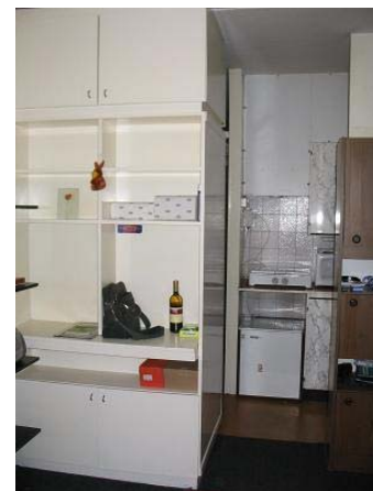
Private rental, the renter considers living here as a temporary solution.