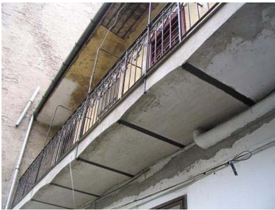
Run down building under renovation in the transition zone. The pipeline indicates that a bathroom has been added to the dwelling.