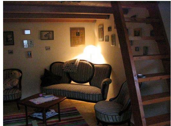
Rehabilitation area, renovated multi-unit building. The division of the floor space made it possible to have a “separate” bedroom.