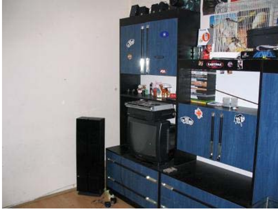
Room without window in a central district. The room was separated to provide for an “independent” room for one of the children