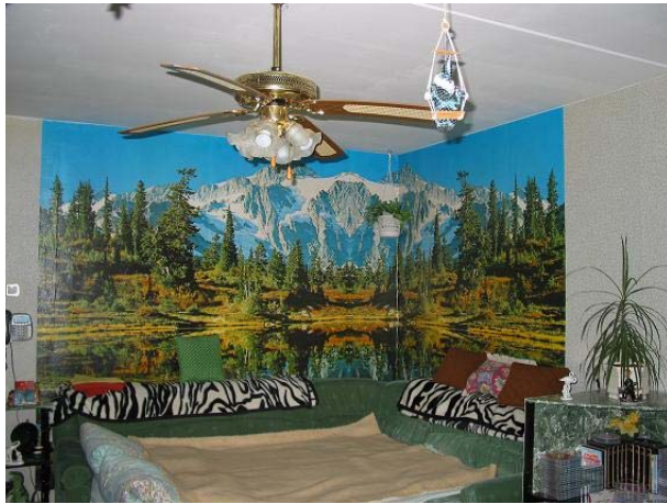
Run down dwelling in the transition zone on a large housing estate