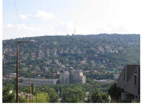
Highly prestigious area in Budapest