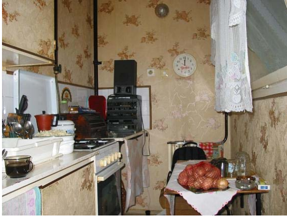
Run-down kitchen on a big housing estate.