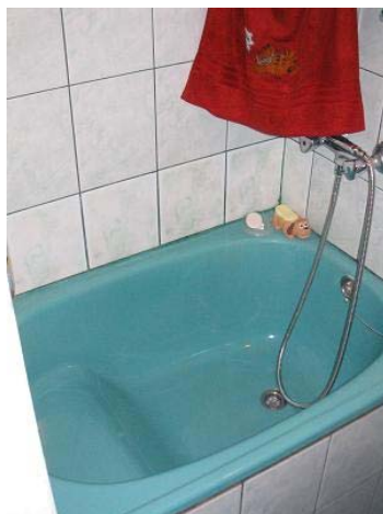
Self-constructed bathroom in a public rental (app. 2 m2)