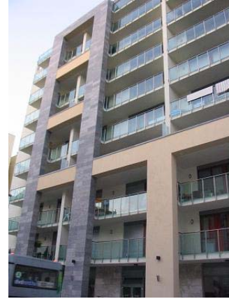
Newly built house in a prestigious area