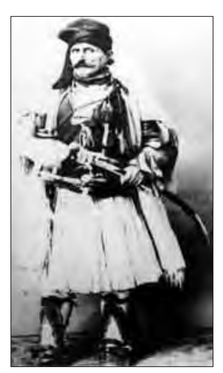
Figure 1: Ilyo Voivoda, a 19<sup>th</sup> Century rebel leader in Bulgaria

of Ali Pasha of Yanina (1788-1822). Two local bandit groups (led by Osman and Mehmed) frequently attacked the region. Kuzman gathered men from the nearby towns of Debar and Kicevo to fight the bandits and he successfully put an end to the attacks. The men were described as having white shirts from Yanina, Prizren long rifles, and Voden pistols.<sup>18</sup>