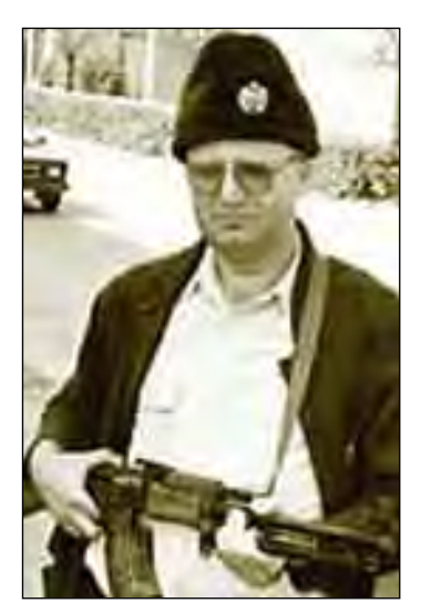
Figure 8 – Vojislav Seselj

During the conflicts in former Yugoslavia, it was extremely common to see politicians carrying guns in public. Politicians and popular figures frequently appeared in public in military uniform, sometimes waving handguns and even assault rifles. This was especially true for the radical nationalist parties: Vojislav Seselj, leader of the nationalist Serbian Radical Party, was famous for threatening his political opponents and critics with a handgun. He was also photographed in 1991 with his own paramilitary unit in torn-down Vukovar, posing with a machine gun in his hand. The notorious criminal and paramilitary leader, Zeljko Raznatovic Arkan, who founded and led the Serbian Unity Party, was often seen parading in his military uniform and toting his weapons. In Croatia, many people perceived members of the Croatian Army, and the paramilitary groups associated with the Croatian Party of Rights, as public heroes and role models. Even politicians, who were not part of the military structure, would proudly appear in public in uniforms and with firearms. The frequency of these public displays of weaponry decreased dramatically after the conflicts ended. This could be because politicians and military figures were using firearms, as symbols of independence and freedom, to mobilise the masses for the war effort and to make the war more acceptable to the public. How these behaviours and images of guns have impacted on the way guns are represented today is debatable.