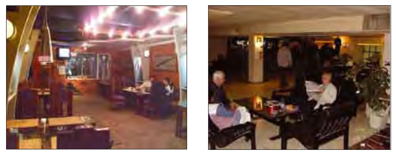
Figure 2: The lounge and bar areas of the Magnum Gun Club in Chisinau (left) and the Levski Shooting Club in Sofia (right), where clients can watch the shooting through a soundproof glass window, while they socialise or wait for their turn to shoot.

Sports shooting has probably been officially established for the longest in Montenegro , which has had a shooting union since 1848. The Montenegrin Shooting Union's website says, 'shooting has deep roots in Montenegrin society, expressed in the saying, " a house can burn down, but a rifle – never !"<sup>457</sup> The website reproduces the image of guns as eternal and unbeatable, and an essential part of Montenegrin culture. Statistics show that sports shooting in Montenegro is a popular reason to own a gun when compared to other countries and territories in the region.