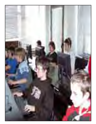
Figure 11 - Counter-Strike

Computer games have become one of the most powerful media for widening knowledge about guns among young people in SEE, and they are likely to remain so for the foreseeable future. There are no studies that have examined, either how many people are actively involved or exposed to computer games in the region, or the links between computer games, gun use and gun violence. Research in the United States has shown that young people who play violent computer games show more aggression to their peers than those who have not played them.<sup>90</sup> However, Internet and computer access in SEE is much lower than in OECD (Organisation for Economic Cooperation and Development) countries. This means that computer games as a means of reproducing images of illegal gun use and possession as acceptable are of less concern than in other areas of the world.