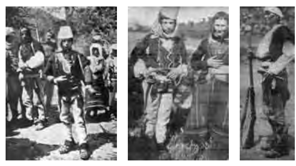
Figure 7 - Sworn Virgins

evidence about it is scarce. In Albania, before 1912, weapons were an essential part of a man's attire. They would wear a long rifle called an arnautka , and a short sword or a couple of pistols in their belt. When a boy reached 12 to 15 years old, there was a special family ritual, where his father presented his son with these traditional weapons and taught him how to maintain them and how to shoot accurately.<sup>75</sup> Fathers traditionally pass guns down to their sons as family heirlooms, in rural areas of Macedonia, where the population is predominantly Albanian.