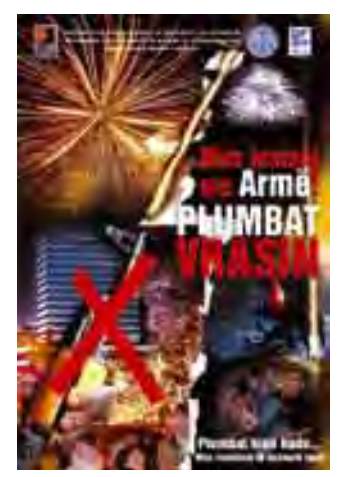
Figure 5 – Campaign poster against celebratory gunfire, New Year's 2005/2006, Albania

In Croatia celebratory gunfire is viewed as an acceptable practice as part of marriage ceremonies and at some religious festivals in certain regions of Croatia: in the Cetina Valley (at the foot of the Dinaric Alps), in Hrvatsko Zagorje, (in North Western Croatia) and along parts of the coast in Dubrovnik, on Rab Island or Korčula Island. Celebratory gunfire occurred more frequently in the 1990s. Incidences have declined in recent years due to public campaigns, initiated by the Ministry for Internal Affairs, and negative coverage of the practice by the media. The main catalyst for the campaigns was a number of tragic incidents, where onlookers were injured and killed as a result of celebratory gunfire.