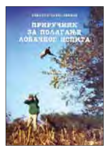
Figure 9 – Hunting Manual, Serbia

Print and electronic media are probably the most influential ways of shaping and reinforcing either positive or negative images of guns. Governments in the former Yugoslavia and in Moldova used electronic media as a propaganda tool in the 1990s, to mobilize popular support. Television broadcasters often used to show political and military leaders, and heroes, carrying guns. Specialized journals have appeared in recent years catering for hunters, gun lovers, and military people across SEE. These only cater for specialist groups and not the public but it is easy for a wider audience to access specialized television channels and shows for gun users. There have been no studies to analyse the impact of the overwhelming presence of arms on the television, the internet, or in the print media.