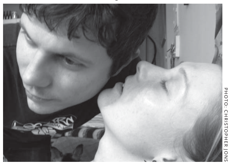
To check for breathing, put your ear near the person's mouth and nose to listen for breath sounds while watching the chest to see if it is rising and falling consistently.