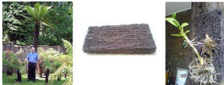
Figure 2: Pakis Trees, Pakis-Stem Blocks, and Orchid on Pakis Block

Applying rows of pieces of Pakis blocks over the flat rooftop concrete as external environmental friendly insulation, the room thermal will be controlled diminishly. Pakis-stem blocks are used by orchid flower users that they attach the orchids on Pakis block and Pakis blocks are sold at flower shops. Those Pakis blocks come from Pakis trees which could be found at the jungle; the Pakis stem is then be sliced into pieces of Pakis blocks.