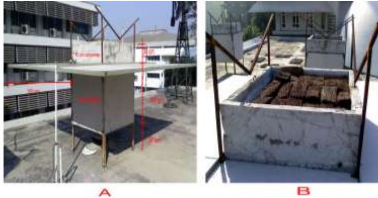
Figure 4: A. The model, B. Covered model with Pakis-stem Blocks