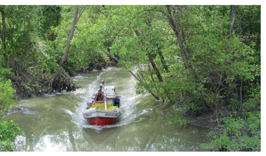
Emerging from the embrace of a mangrove tree-lined channel in northern Brazil, these pescadores, like coastal fishers worldwide, know that healthy mangroves mean good fishing and a secure livelihood.

Mangrove forests once covered more than 200,000 km<sup>2</sup> of sheltered tropical and subtropical coastlines (1). They are disappearing worldwide by 1 to 2% per year, a rate greater than or equal to declines in adjacent coral reefs or tropical rainforests (2-5). Losses are occur-