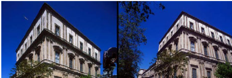
Figure 9. Converging lines due to excessive shifting motion.

Photography is the only medium that enables architectural works to be shared with people who do not have access to these works. It is, in this respect, the ultimate representation of architecture that is built. There are various techniques, lenses, rules of thumb that are used in architectural photography in order to make the process as “appropriate” as possible. But these special techniques usually provide us with unique visual recording possibilities that are practically and physically impossible to the naked eye. The so-called “perspective correction” process much used in architectural photography, carries the potential of producing some steeply converging lines, especially when the photographer is close to the building to be photographed. Consequently, the shifting motion in photography causes another shift in our perception: photography does not reflect the truth.