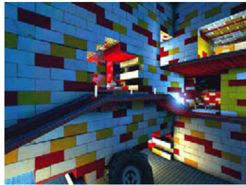
Figures 1 & 2. Left: An “architectural” greeting card. Right: Lego architecture

“Representation includes everything people construct to be known as a visual record or figurative manifestation of that reality. [...] Within this approach, architects usually reduce the definition of representation to the creation of such visual forms as drawings or models that selectively double or imitate the physical reality of a building. I would like to move beyond this traditional view to define representation as a culture-specific and dynamic process of establishing the relationships between reality and the signs created to symbolize this reality. In this process, reality becomes thinkable, and its meanings are symbolically assigned.” (Piotrowski and Robinson 2001: 42)