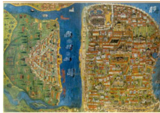
Figure 3 & 4. Ottoman miniatures depicting Bagdad (left) and Istanbul (right) by Matrakci Nasuh.