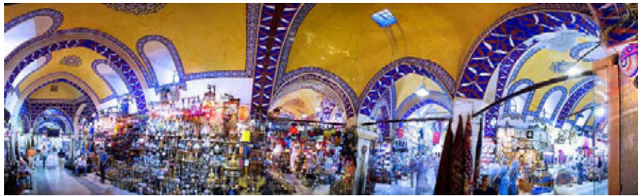
Figure 5. Panoramic photograph of the Covered Bazaar, a “cubist” documentation resulting from the viewer’s accumulation of the experiences in situ: A moment where perception stops being “pure” motion.

As the space of representation, a building only foregrounds concepts of reality and implies modes of thought and perception. For example, it invites a tacit dialogue between old and new, or between a culturally shared and a personal sense of reality. Whatever exists or happens in a building, we interact with it symbolically. Any building admits various and even conflicting concepts of reality. [...] Such hybridity of meanings is possible because concepts of reality and physical forms of buildings, although symbolically related, are never fully codependent; they are differently constructed. [...] Because buildings do not impose concepts of reality but make them thinkable, many concepts may coexist and be in symbolic dialogue with one another within a physical space. [...] Similarly, it does matter how a person interacting with a building finds personal relevance in this interaction. To reveal these kinds of meanings, the building must somehow engage, like Lacan's mirror, a personal sense of reality.” (Piotrowski and Robinson 2001: 43, 44, 45) This personal sense of reality makes us question the inherent nature of the concept of ‘representation’ and helps us to extend it into a more flexible (and maybe more correct) notion / formulation of ‘re-presentation.’