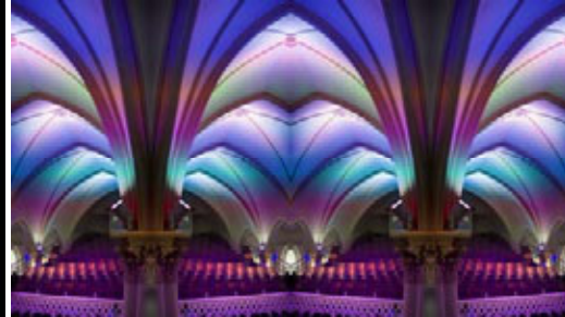
Figure 15, 16 & 17. “Kanyon: Under Construction” exhibit(left & middle). Process: Vertical panoramic photography; took 8 photos, stitched them, mirrored the resulting image in order to complete the ‘reconstruction’ process. “Repetition: what does it produce, give (back), duplicate, yield, deliver, conceive, return, engender? -- Sylviane Agacinski” (Easterbrook 1995: 177). Notre Dame de Sion concept exhibit (right).