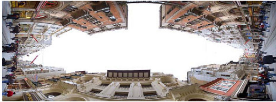
Figure 6. Panoramic photograph of Istiklal Avenue in Istanbul showing both ends of the large pedestrian artery: A personal sense of reality, in other words “re-presentation.” Photo by Murat Germen, Istanbul, Turkey.

Movie industry is another platform in which representation has a significant part, especially when it comes to adapting / altering / converting cities for particular needs such as creating futuristic sci-fi cities / architecture that never existed. A particular type of illustration called “matte painting” created by illustrators (and not architects) usually serve as departing points for such architecture. The fact that illustrators can create virtual architecture can also lead to the assumption that photographers who can read space properly can use photography as a tool to re-invent, re-interpret and re-form architecture.