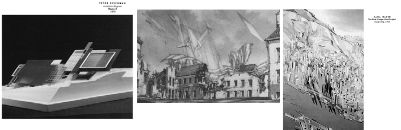
Figure 18, 19 & 20. "Model" architecture, Peter Eisenman (left); "paper" architecture, Lebbeus Woods (middle) and Zaha Hadid (right).

This paper focuses on the possibility of (re)designing architecture virtually with the help of one of the most important visual realms: Photography. Various digital processes like stitching multiple photos together and mirroring images in image editing software like Photoshop, allow this virtual architecture to take place in the computer environment. Following this, I propose to raise the term "snap architecture" to connect it to the frequently referred concept of "paper architecture." I will close with a quote from Terence Wright: "In the art photograph, it may be the photographer's intention to let aspects of the image be ambiguous, leaving it open to a wider spectrum of imaginative possibilities on the part of the viewer." (Wright 1999: 83)