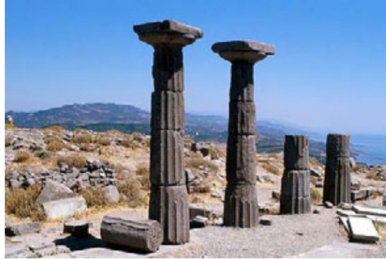
Figures 10 & 11. Incomplete ruins that push us to solve the puzzle. Photos by Murat Germen, Assos, Turkey.