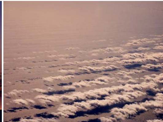
Figure 13 & 14. Construction sites can be conceived as stages where this never-finishing process is being "performed" over and over (left). Clouds as perfect examples of organic natural forms (right).

Architectural photography has the potential of re-creating the previously mentioned puzzle back again in order to bring an alternative representation to architecture. The architectural photographer is sometimes offered the freedom of reinterpreting, reconstructing architecture in order to be able to present a novel virtual perception to the audience. The idea here is to get some spatial clues that can later be used in other architectural projects. I was personally invited to two different concept exhibits in which I was given the freedom of inventing a virtual architecture through photography. The