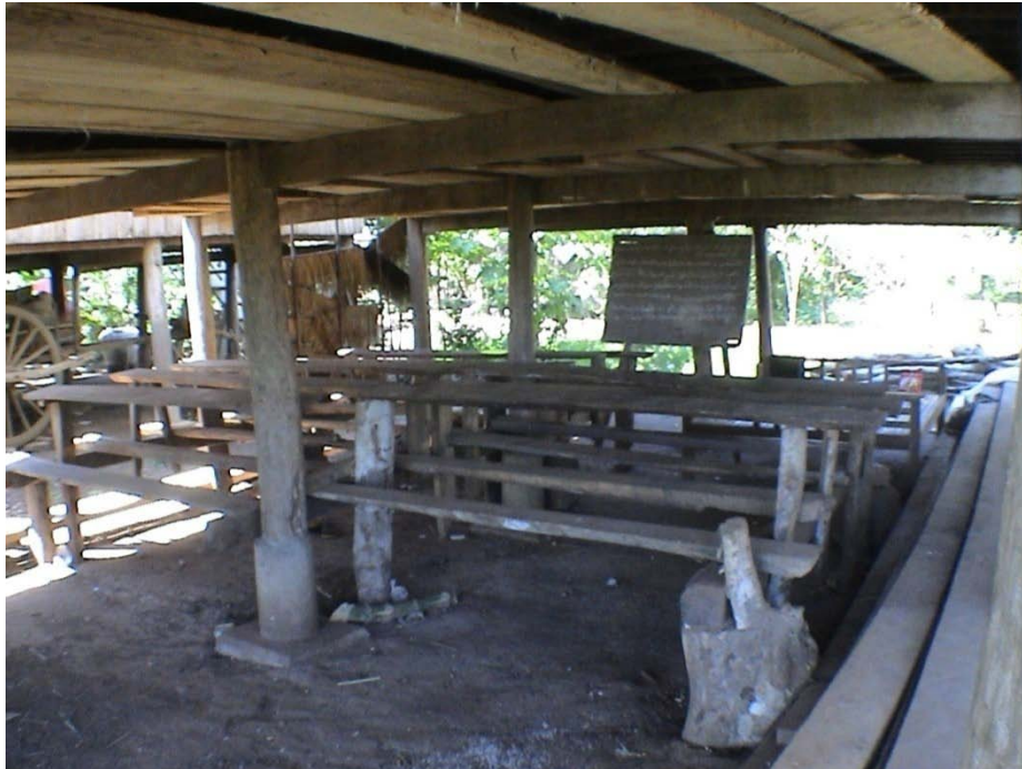
A class room under a house in Dang Kambit, Kompong Cham

Despite of all harassments by his foes, the poor infrastructure of the areas along the Mekong river and most of all the shortage of fund, he managed to set up pondok , one after the other, in various villages where there were his followers. These schools were nothing more than a few tables and long wooden benches set up under some houses, especially the imam's house. In some villages, classes were conducted in surau or masjid as the Kaum Muda followers are majority. Beside those so-called pondok , the first religious school was built in Phum Khbop, Khum Svay Khléang in 1968. The building of this school could not be completed as the Cambodian civil war, a spill over of the second Vietnam War, has started in 1970.