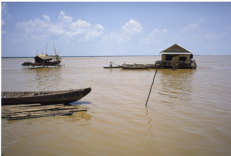
A floating Surau in Choeung Khnéas village, Siemreap