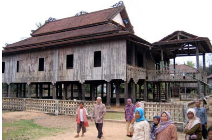
A mosque in a village of the district of Krauch Chmar, Kompong Cham. (Photo: Agnès De Féo, 2007)

the centre had to fork out another USD15.00 per student per month to cover the expenses.