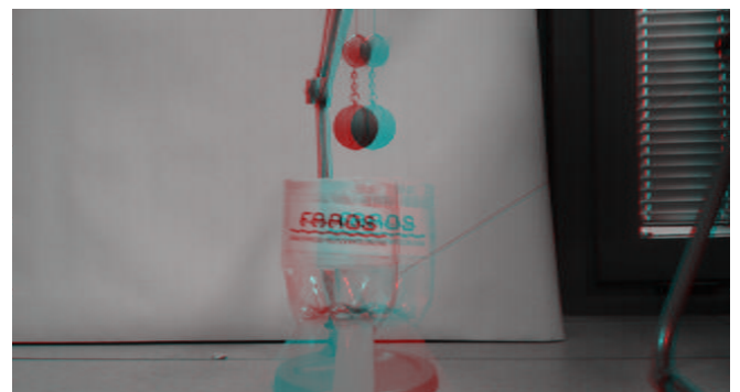
Fig. 1. Stereoscopic view captured from the 3D smartphone during a test. Rendered as a red-cyan anaglyph for printing only.

The following hardware components, shown in Fig. 2, have been selected for the implementation. (1) 3D smartphone . We used an HTC Evo 3D with a 5 megapixel stereoscopic autofocus camera, an 1.2 GHz dual core Qualcomm Snapdragon (ARmV7) processor, 1 GB of RAM memory and WiFi b/g/n support. The OS used for the software development was Android 2.3 Gingerbread with Linux kernel version 2.6.35.13 release htc-kernel@amd18-2. (2) Wireless access point . We used a Linksys WRT54GL WiFi router with 802.11