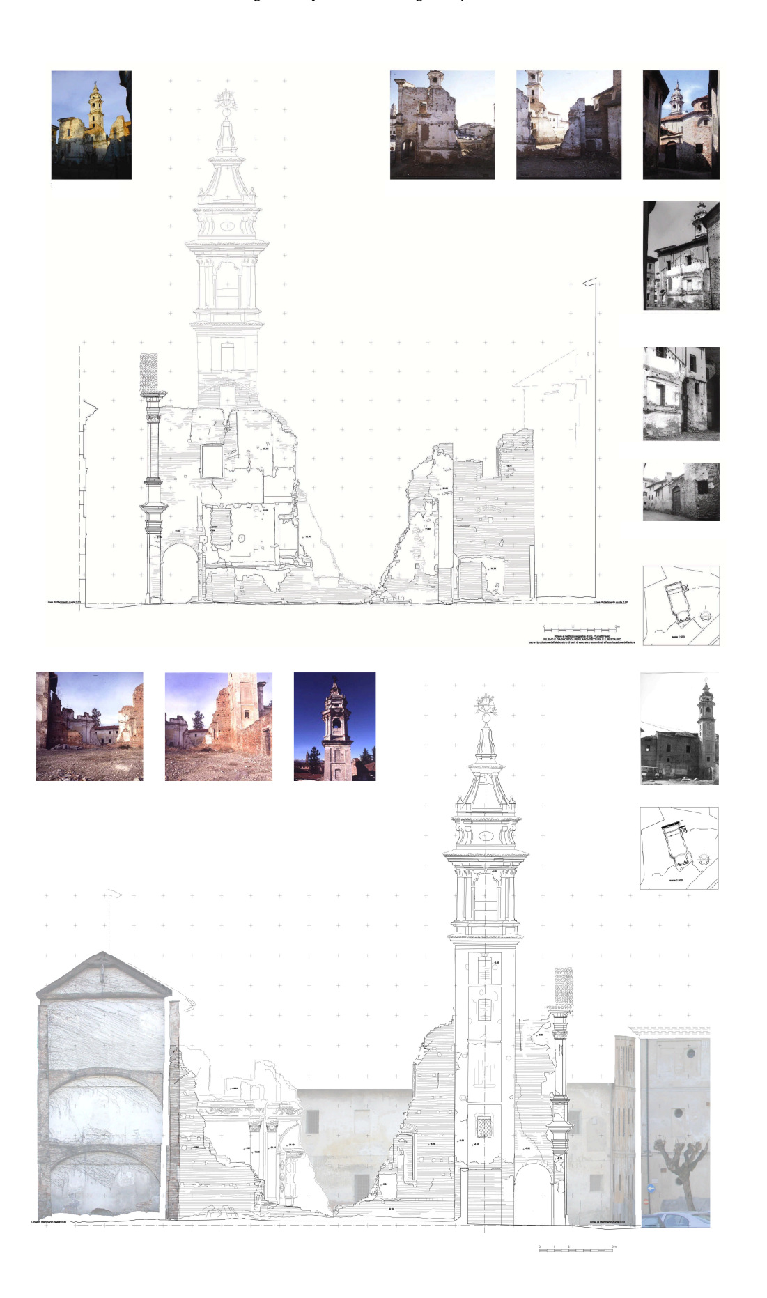
Figure 7. 2D representation of the results: photogrammetric survey, rectified images and photographic documentation (drawing by Paolo Piumatti)