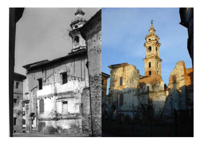
Figure 2. The church before and after the damage of 1984

Since then Croce Nera church has been a ruin: the roof, the vaults and part of the flanks and the apse have collapsed. The area where the church stands is still off-limits (see Fig. 2).