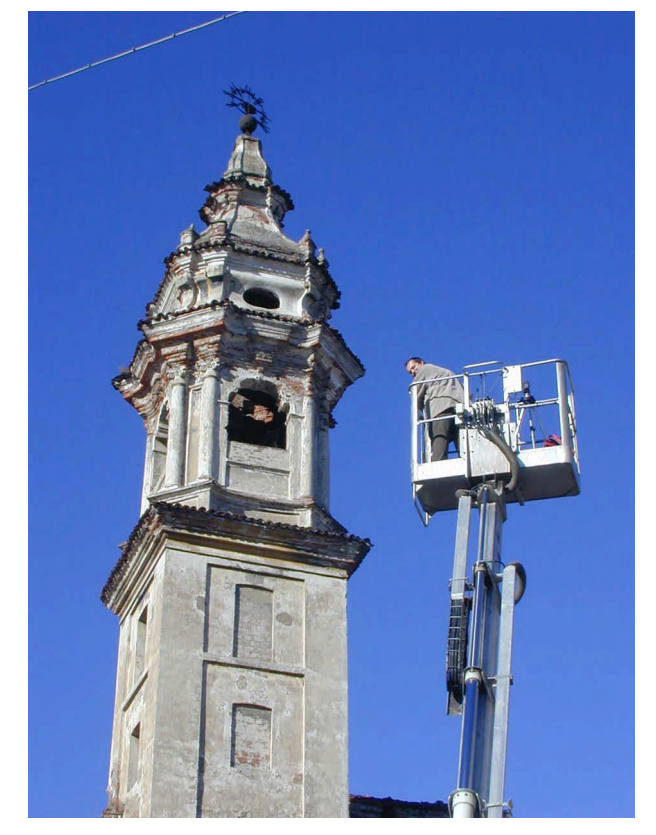
Figure 3. Photogrammetric taken of the bell tower

The survey of the control points necessary for the image orientation and the survey of the building facades has been done by a traditional topographical approach using a reflectorless total station.