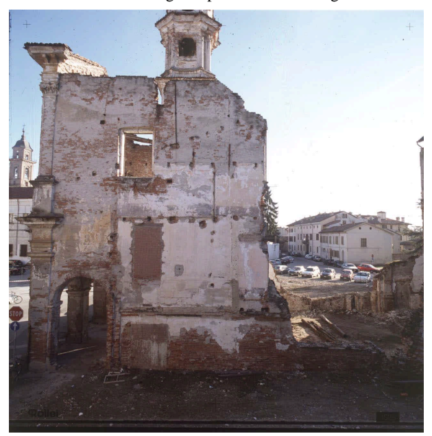
Figure 4. Semimetric image of the church

images. A radiometric adjustment has been performed in order to reduce the different light exposures of the images used.