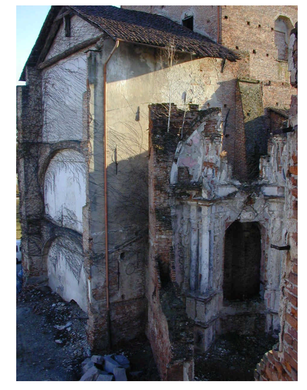
Figure 3. Rests of the vaults