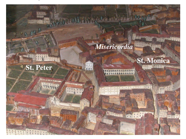
Figure 1. Urban hand made 3D model (M. Nicolosino, 1815) showing the church and the surrounding religious buildings (Local Museum of Savigliano)

The ruins of the church Confraternita della Misericordia , also called Croce Nera , form an area of decay in the historical centre of Savigliano, a city of ancient origin in southern Piedmont. The historical centre of this town developed inside the medieval fortified walls, and it is mainly composed of complex buildings of religious origin, now used for cultural and educational purposes (like the St. Peter's, St. Chiara's and St. Francisco's convents) or abandoned, like the St. Monica's convent and the Confraternita della Misericordia .