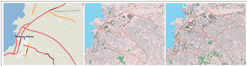
Figure 1 – OpenStreetMap coverage on Port-au-Prince before (left), as of 15 February (middle) and as of 26 February (right) .

Due to the size of the event and for the interest of an enlarged community for accessing to geographic data, a specific WebGIS application was designed and implemented, including editing capabilities on specific datasets.