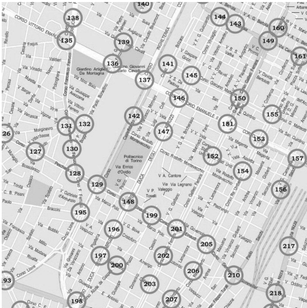
Fig. 1 An example of coded junctions on the city map