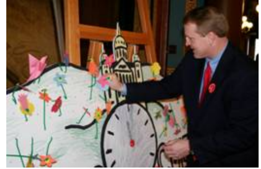
Governor Chet Culver places a flower on the mural "Time for Culture" by artist Brent Houzenga of Des Moines.