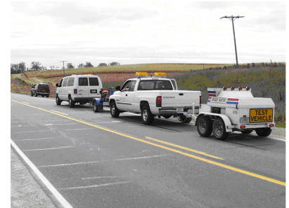
Measuring deflections with FWD and Road Rater