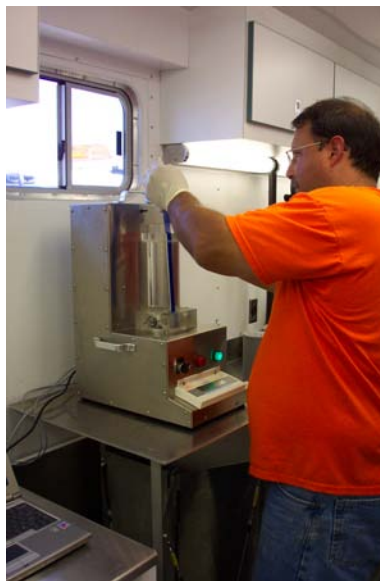
Research technician performing a test using the AVA on the isolation base

Until recently, the only method to evaluate the complete concrete air void system was by taking a sample of the concrete after it has hardened. The spacing factor and specific surface are measured in the laboratory using a microscope and other specialized equipment (ASTM C 457). Because the hardened concrete sample is typically taken a minimum of 3 days after placement and the results are typically not available for at least two weeks, the results are obtained too late to make adjustments to the concrete mixture.