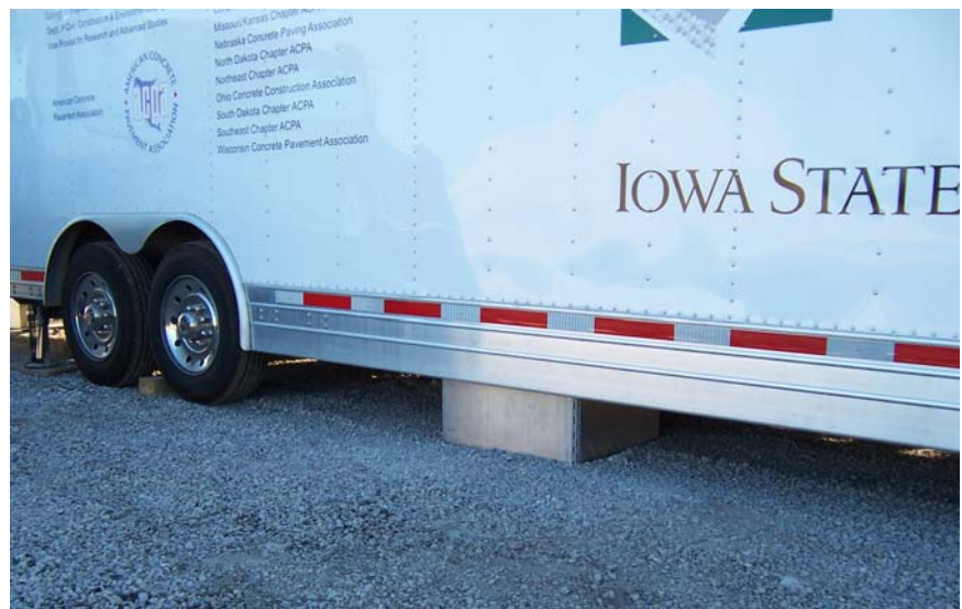
View of the weather shield from the exterior of the PCC Center Mobile Concrete Research Lab

In 2004, the PCC Center custom-designed its Mobile Concrete Research Lab to provide a method of using the AVA in the field without being affected by vibrations. A portal was built in the floor of the mobile lab to accommodate the AVA. A three-legged stand is lowered through the floor portal to rest on the ground. A weather shield surrounds the base of the stand. The AVA sits on a deck on top of the stand within the lab. The AVA is protected by the trailer but does not touch the trailer. This provides a method of obtaining accurate AVA results in the field for more timely, convenient, and cost-effective quality control.