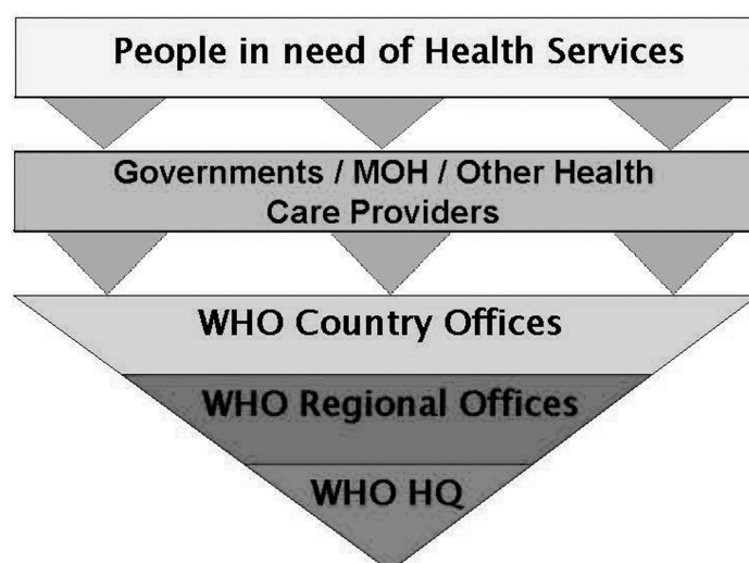
Fig. 2 The WHO model for service delivery

Fig. 2 shows how the various levels of WHO are linked together to deliver HIV/AIDS services to people living in WHO Member States in need of health services and to the governments of the Member States. Fig. 2 illustrates that people in need of health services are the most important concern. Within WHO, the inverted pyramid demonstrates how each level of the organization acts to assist and enable those above it in providing the required services to Member States and their citizens.