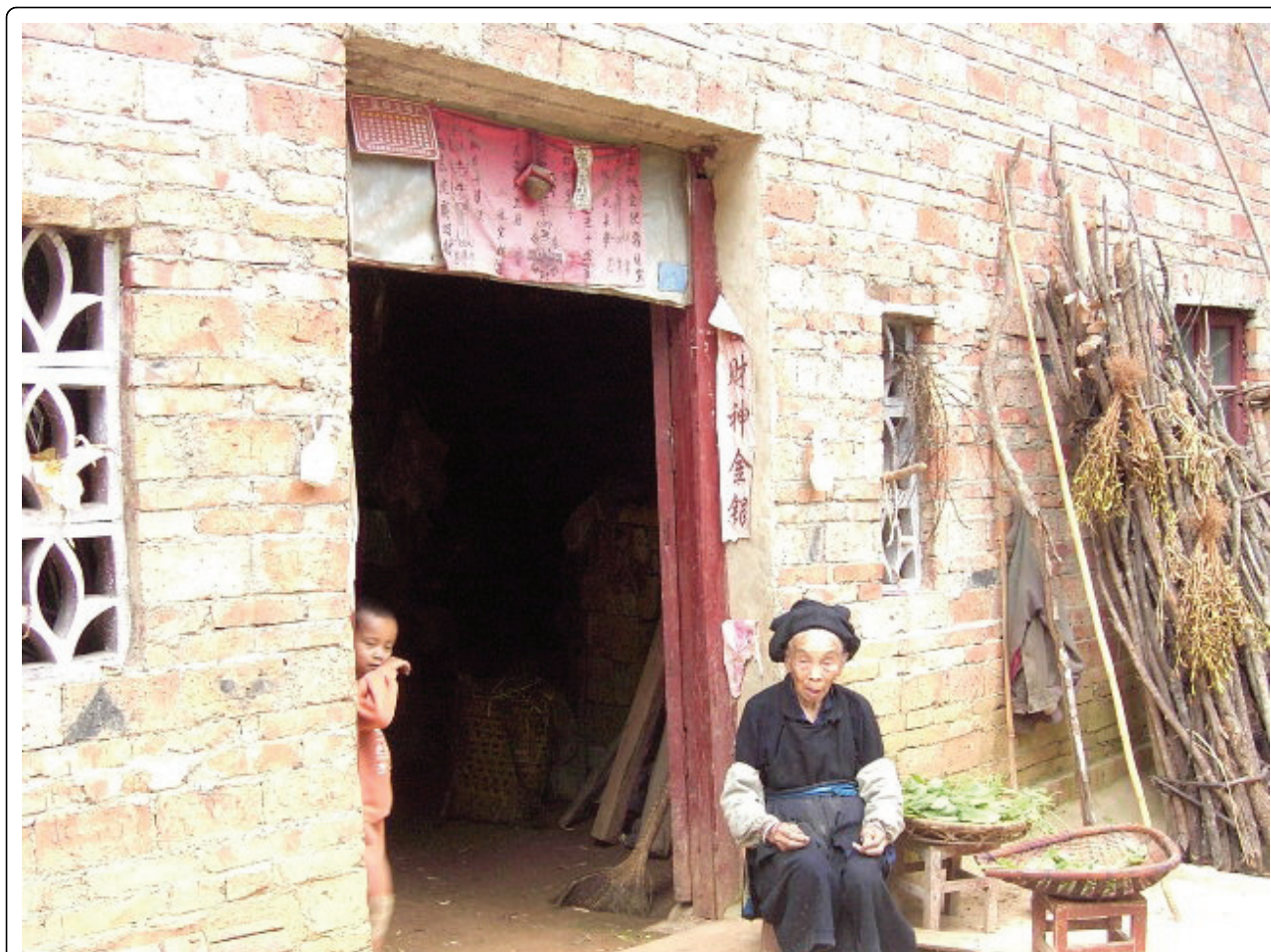
Figure 2 A village herbalist in rural Yunnan, Southern China. This lady was a key informant for an ethnobotanical study into plants used to repel mosquitoes

was originally extracted for use in perfumery, and its name derives from the French citronelle around 1858 [28]. It was used by the Indian Army to repel mosquitoes at the beginning of the 20 th century [29] and was then registered for commercial use in the USA in 1948 [30]. Today, citronella is one of the most widely used natural repellents on the market, used at concentrations of 5-10%. This is lower than most other commercial repellents but higher concentrations can cause skin sensitivity. However, there are relatively few studies that have been carried out to determine the efficacy of essential oils from citronella as arthropod repellents. Citronella-based repellents only protect from host-seeking mosquitoes for about two hours although formulation of the repellent is very important [31,32]. Initially, citronella, which contains citronellal, citronellol, geraniol, citral, \alpha pinene, and limonene, is as effective dose for dose as DEET [33], but the oils rapidly evaporate causing loss of efficacy and leaving the user unprotected. However, by mixing the essential oil of Cymbopogon