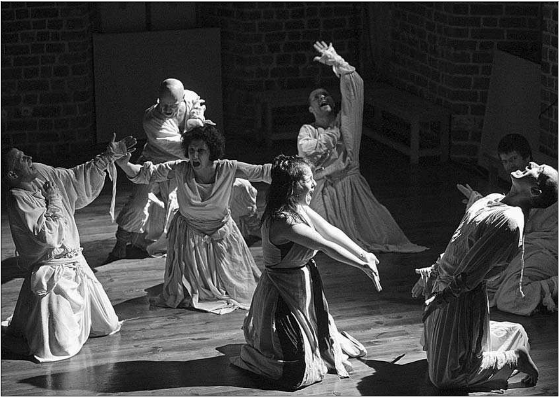
Lamentations in Lacrimosa .

tioners understand this, because it comes with the understanding of the practice: if you name something, if you give a simple definition to something, you stop the process. You close the experience. In the moment of naming something, the process is over. You have to start another one. If you name something an 'impulse', you've actually lost it. If you focus on something that is an impulse, in that very moment you've lost it. So, in order to follow something that you call 'impulse', you must, in a way, not recognize it. There is something like a 'way' that feeds the impulses and, as Anna says, she has to recognize her own way. If she recognizes her own way, then the way that Stanislavsky would call the 'internal monologue' is composed of millions and billions of impulses that you must never focus on.